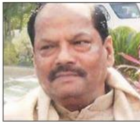
The Raghubar Das-led BJP emerged as the leading party in at least 57 Assembly segments in Jharkhand in 2019 Lok Sabha elections

In 2014, among the 19 seats with a thin victory margin, most went to the BJP-AJSU alliance