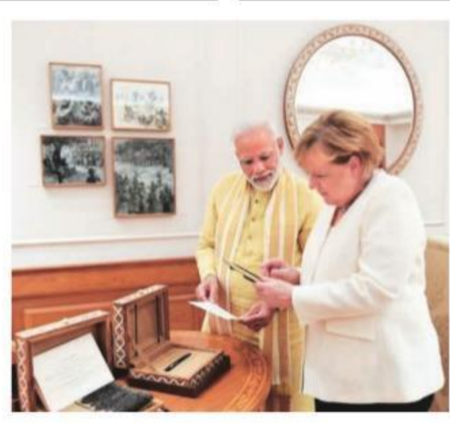
Prime Minister Narendra Modi gifts German Chancellor Angela Merkel a Ratnam pen and a handloom woollen Khadi stole, in New Delhi, on Friday.