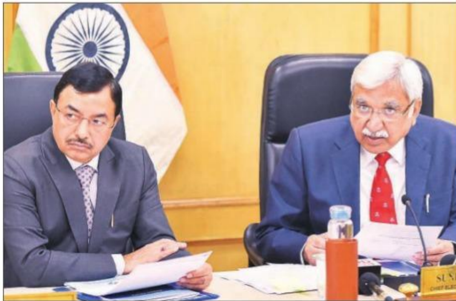
Chief Election Commissioner Sunil Arora (right) with Election Commissioner Sunil Chandra at a press conference to announce the schedule for Jharkhand Assembly polls, at Nirvachan Sadan, in New Delhi on Friday.

The BJP now has 48 seats in the Assembly, with five MLAs from Opposition parties having