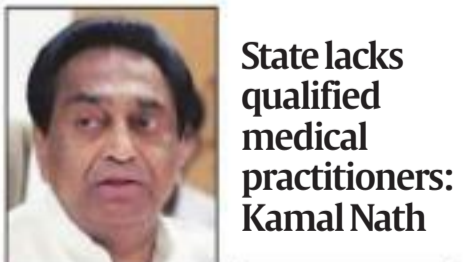
State lacks qualified medical practitioners: Kamal Nath

Inaugurating the event, the CM said right to health is the most important among human rights. He added that the state will have to ensure not just infrastructure and financial resources but also skilled manpower to ensure peo-