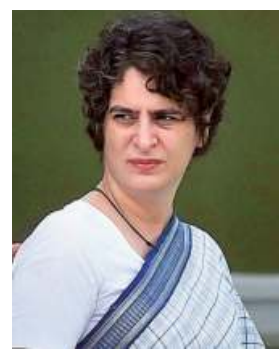
It is a gross violation of human rights and a scandal with grave ramifications ...

Her comments came a day after the Congress urged the Supreme Court to take suo motu notice on the revelation made by messaging platform WhatsApp that a software program, Pegasus, developed by an Israeli firm was used to hack into the phones of journalists, acti-