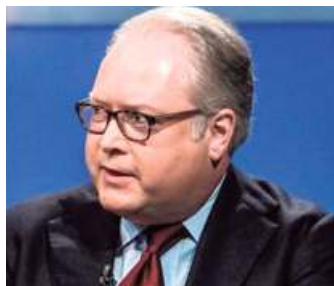
George Holding.

"These militant groups have also attacked migrant workers and those who are involved in the apple business, which is the chief