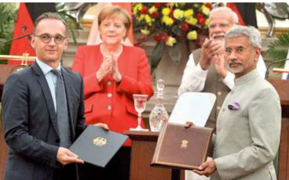
Sealing a deal: Foreign Minister S. Jaishankar with his German counterpart, Heiko Maas, in New Delhi on Friday.

He said that given the strong commercial ties with Germany, India considers its support important in mobilising efforts within the European Union for early resumption