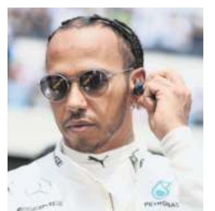
150th podium finish.

He may be keen also to register something better as he seeks another Texas triumph, his sixth in eight outings in Austin and his seventh win in the American event and, at the very least, his