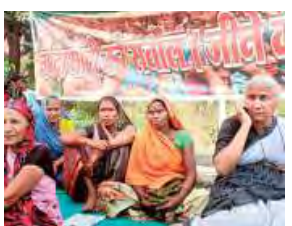
Activist Medha Patkar along with the villagers protesting in Bhopal, on Sunday.