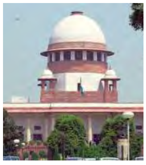
mission to women officers with retrospective effect, and expand the ambit of the benefit to those serving under SSC before March 2019. "It will show India in a dif-

The court asked the Centre to look at the positive side of granting permanent com-