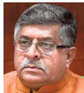
Ravi Shankar Prasad

Following the judgment, telecom firms now owe ₹1.47 lakh crore in licence fees (₹92,642 crore) and spectrum usage charge (₹55,054.51 crore), Minister of Communications Ravi Shankar Prasad informed the Lok Sabha. However, these are provisional out-