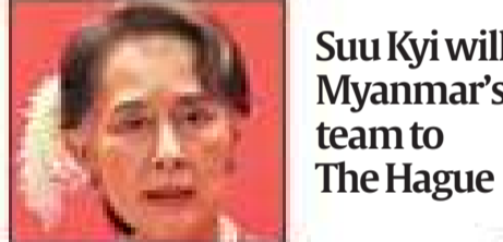
Suu Kyi will Myanmar's team to The Hague

AUNG SAN Suu Kyi will appear before the International Court of Justice (ICJ) to contest a case filed by Gambia accusing Myanmar of genocide against its Rohingya Muslim minority, her government said on Wednesday. More than 730,000 Rohingya have fled to Bangladesh since a 2017 crackdown by Myanmar's military, which UN investigators say was carried out with "genocidal intent". Myanmar denies accusations of genocide.