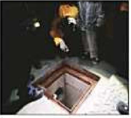
Protesters look inside a sewer for an escape route. Reuters

SOME ANTI-GOVERNMENT protesters trapped inside a Hong Kong university on Wednesday tried to flee through the sewers, where one student said she saw snakes, but firemen prevented further escape bids by blocking a metal manhole into the system. Reuters witnesses said fewer than 100 protesters remained inside the Polytechnic University, ring-fenced 24 hours a day by riot police and barricades, after more than 1,000 were arrested from late on Monday. Some surrendered while others were grabbed in escape attempts that