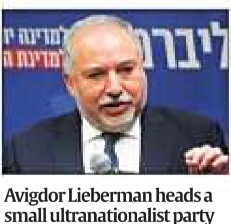
Avigdor Lieberman heads a small ultranationalist party

ISRAELI KINGMAKER politician Avigdor Lieberman on Wednesday refused to endorse a candidate for prime minister, pushing the country toward a new election for the third time in less than a year. Lieberman's comments came ahead of a midnight deadline for Prime Minister Benjamin Netanyahu's rival, Benny Gantz, to form a coalition. Without Lieberman, Gantz appears unable to secure the required majority in parliament to be prime minister. If Israel is forced into a third election, it would be entering uncharted waters, with opinion polls already predicting a very similar deadlock. But a new campaign could benefit the embat-