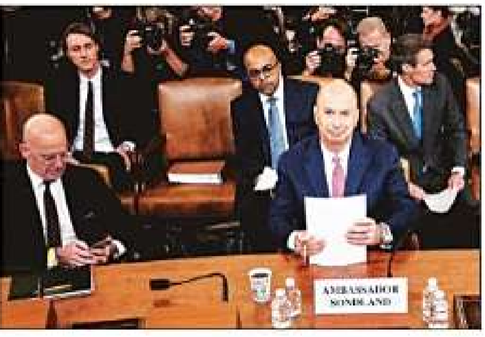
Gordon Sondland, US ambassador to the European Union, at the impeachment inquiry hearing in Washington.

GORDON SONDLAND, the Republican megadonor turned ambassador to the European Union, told the House Intelligence Committee on Wednesday that he and other advisers to US President Donald Trump pressured Ukraine to investigate Democrats "because the President directed us to do so". In much-anticipated testimony opening the fourth day of public impeachment hearings, Sondland said that he, Energy Secretary Rick Perry and Kurt Volker, the special envoy for Ukraine, were reluctant to work with Rudy Giuliani, the President's personal attorney, on the pressure campaign and agreed only at Trump's insistence. "Secretary Perry, Ambassador Volker and I worked with Mr Rudy Giuliani on Ukraine matters at the express direction of the President of the United States," Sondland told the committee.