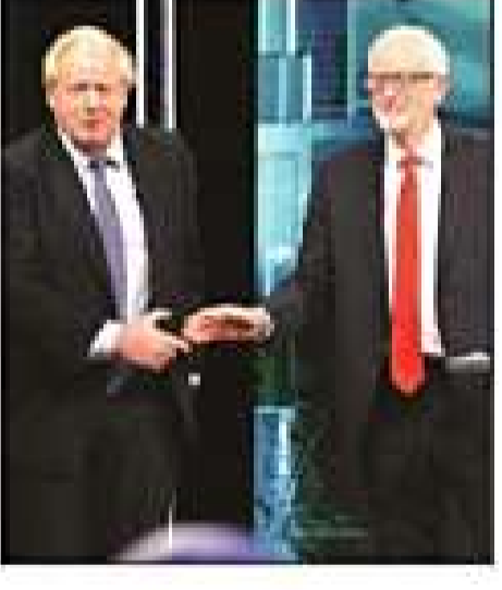
Boris Johnson and Jeremy Corbyn at the debate.

BRITAIN'S CONSERVATIVE Party was accused Wednesday of trying to deceive voters by changing the name of its press office Twitter account to "factcheckUK" during a televised election debate between Prime Minister Boris Johnson and opposition Labour Party leader Jeremy Corbyn. Rebranded to resemble a neutral fact-checking account, it posted a series of tweets supporting Johnson during Tuesday's debate. It later reverted to the name "CCHQ Press" and restored the party logo to its profile. Organisations that seek to combat political misinformation cried foul. "It was an attempt to mislead voters," Will Moy, chief executive of the London-based fact-checking website Full Fact, told the BBC. "And I think it is inappropriate