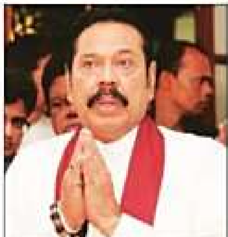
Mahinda Rajapaksa will be sworn in as prime minister and assume office Thursday

Sri Lanka's newly elected president is set to name his brother and current opposition leader Mahinda Rajapaksa as interim prime minister, a party spokesman said on Wednesday, just hours after the sitting premier said he plans to step down.