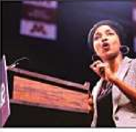
Ilhan Omar was among four freshman lawmakers who Trump said should "go back" to the countries they came from.