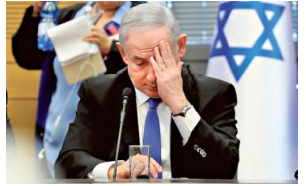
In the hook: Benjamin Netanyahu at a meeting of the right-wing bloc at the Knesset in Jerusalem.

Earlier, during one of the most unusual days in Israeli political history, the country's President told lawmakers to name a candidate to form a new government after right-winger Netanyahu