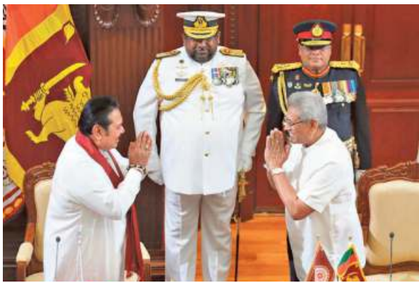
Dual power: Sri Lankan President Gotabaya Rajapaksa, right, greeting his brother Mahinda after he was sworn in as PM.

Prime Minister Narendra Modi was quick to wish his new Sri Lankan counterpart. "Congratulations and best wishes to Prime Minister Mahinda Rajapaksa. I look forward to working closely with him for further strengthen-