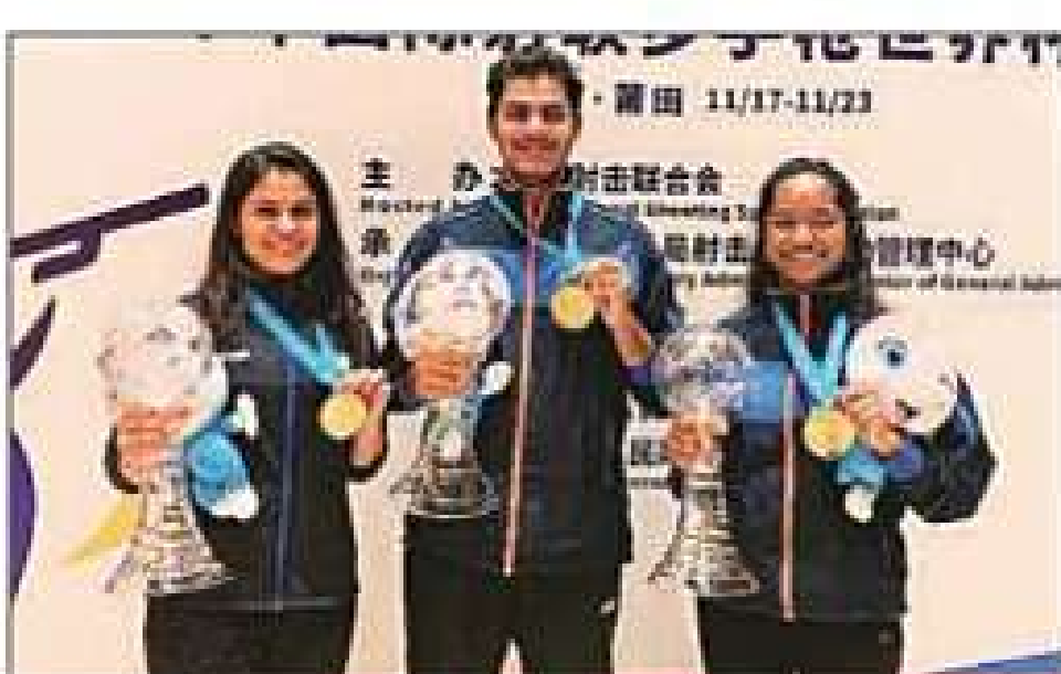
(From left) Manu Bhaker, Divyansh Panwar and Elavenil Valarivan in Putian, China, Thursday.

by becoming the junior world champion in Suhl, Germany, last year, had secured the 2020 Olympics quota for India with a fourth place in Munich World Cup in May.