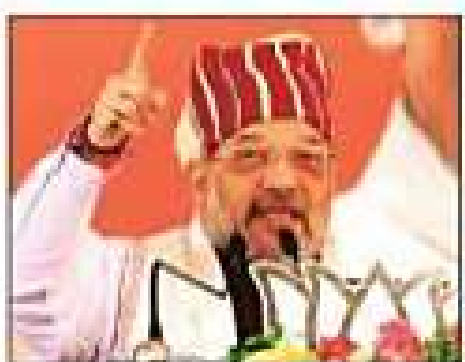
At a rally in Jharkhand on Thursday.

the crowd: "Should the Ram temple be built in Ayodhya or not? Tell me, mothers and sisters. Every person in this country wants a Ram temple. But the Congress stalled the case." It was met with cheers of "Jai Shri Ram".