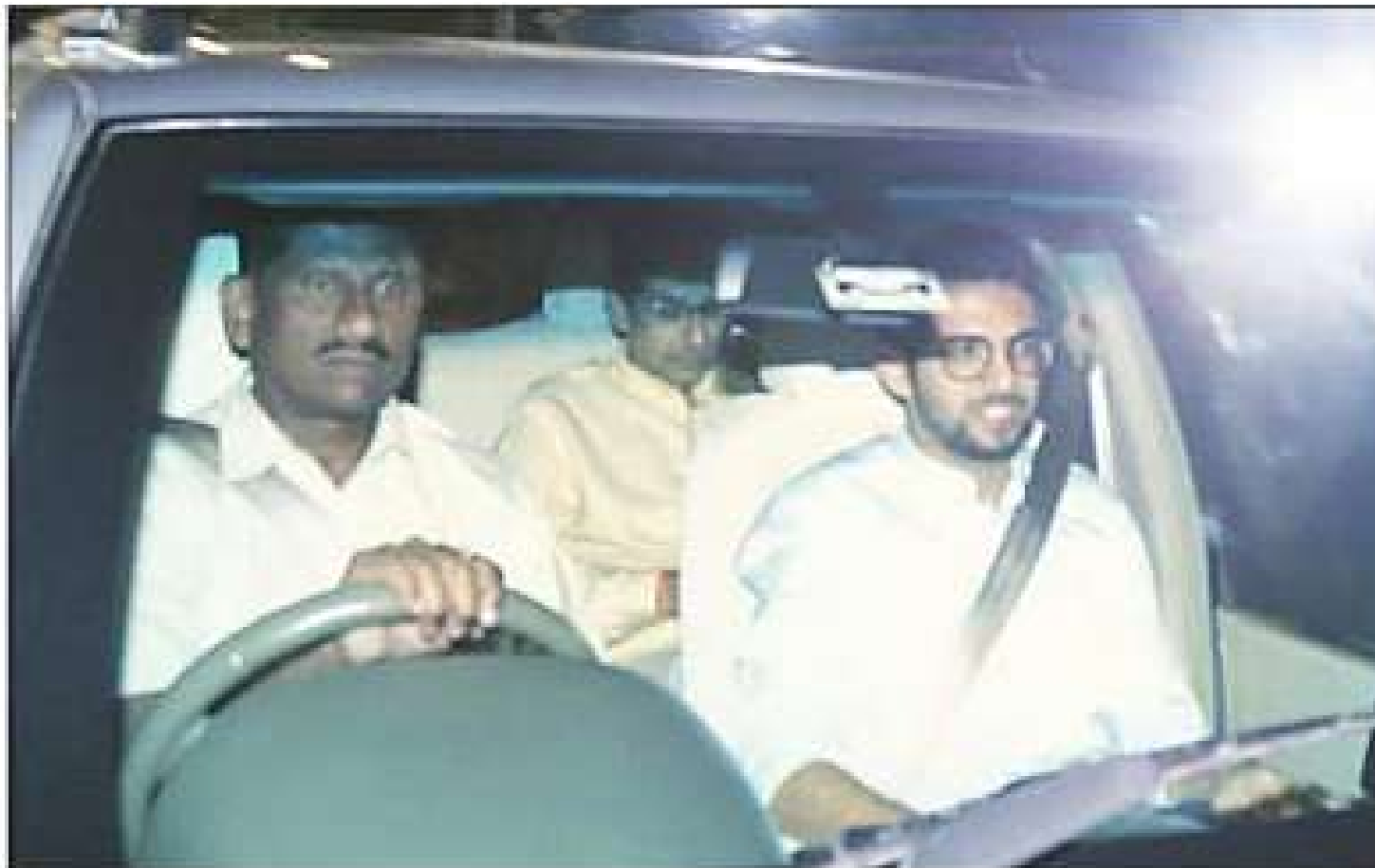
Uddhav and Aaditya Thackeray at Sharad Pawar's Mumbai home, Thursday.