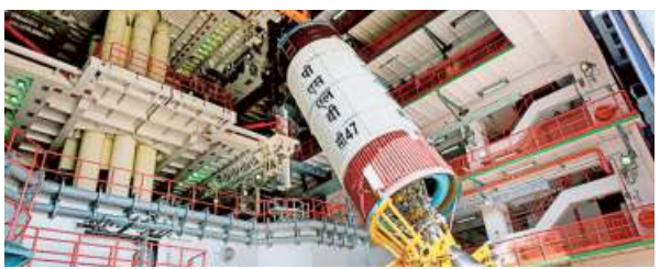
The satellite will be placed in a sun-synchronous or polar orbit of 509 km at an inclination of 97.5 degrees. ■PTI

"Thirteen small customer satellites from the U.S. are also riding on the PSLV-C47 rocket. The launch from Satish Dhawan Space Centre SHAR, Sriharikota, is tentatively scheduled at 9.28 a.m. IST on November 27 subject to weather conditions," an