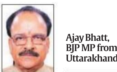
Ajay Bhatt, BJP MP from Uttarakhand

MONTHS AFTER Prime Minister Narendra Modi raised the issue of population control in his Independence Day speech, a BJP MP on Friday introduced a private member's Bill in Lok Sabha, seeking to limit the number of children per married couple to two. The MP also intro-