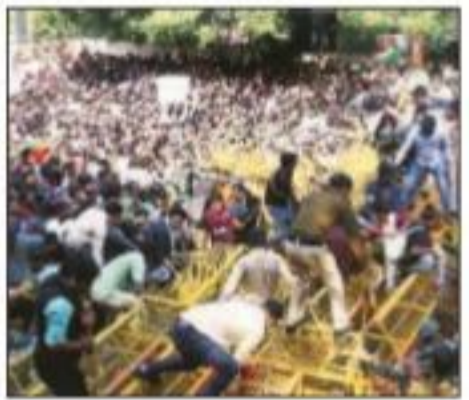
At a protest against the fee hike earlier this week.

The fee hike has led to protests by students and a section of teachers, many of whom believe the university will