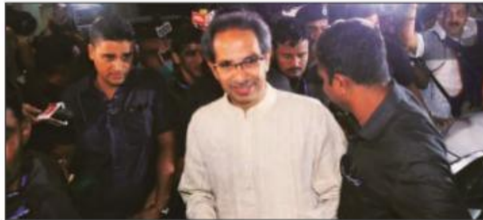
Shiv Sena chief Uddhav Thackeray after the meeting with NCP and Congress, in Mumbai on Friday.

Within the BJP, it was believed that unlike his belligerent father, Thackeray could be kept under control. On Friday, however, it was clear that the BJP and many of his detractors had misread the 59-year-old Thackeray who managed to trigger a tectonic shift in the Shiv