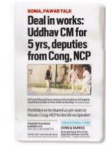
The Indian Express report on November 19

A MONTH after the Maharashtra Assembly elections, and ten days after imposition of President's Rule following an impasse over government formation, rivals NCP, Congress and Shiv Sena reached a consensus Friday evening that Sena chief Uddhav Thackeray will be the new Chief Minister of the state, heading a government of their alliance.