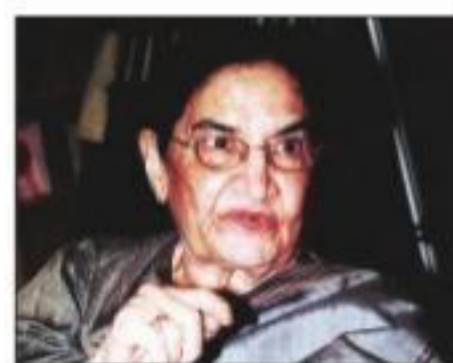
ACTOR SHAUKAT KAIFI DIES AT 91