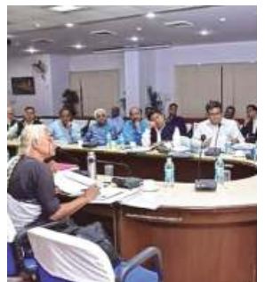
Medha Patkar at a meeting with officials regarding the Sardar Sarovar project.

Damaged crops will be compensated for, relief camps will be set up in Alirajpur district and bridges and roads will be built to reach swathes cut off from the mainland, the government has said. Narmada Ba-