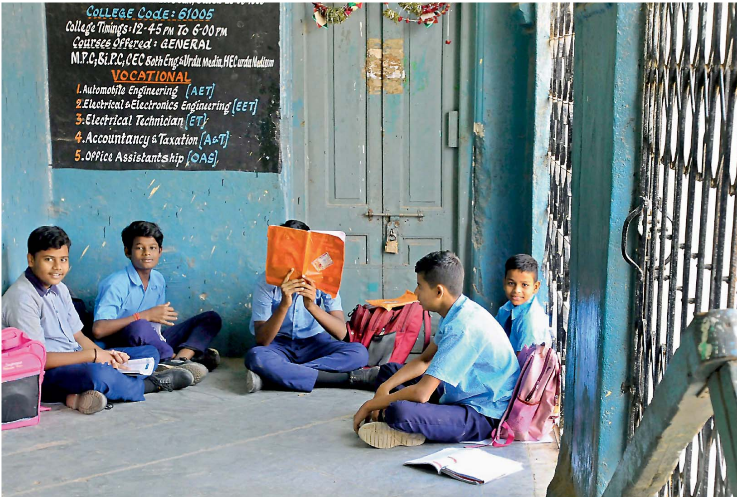
Students punished by the class teacher for improper haircut at the Government Boys High School, Chanchalguda, on Friday.