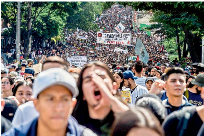
People march during a nationwide strike called by students, unions and indigenous groups to protest against the government of Colombia's President Ivan Duque in Medellin, Colombia. — AFP

Yet the witness accounts left one prominent hole that offered a lifeline for Trump and his GOP allies. None of the witnesses could personally attest that Trump directly conditioned the release of the $400 million in military aid on a Ukrainian announcement of investigations into ex-president Biden. — AP