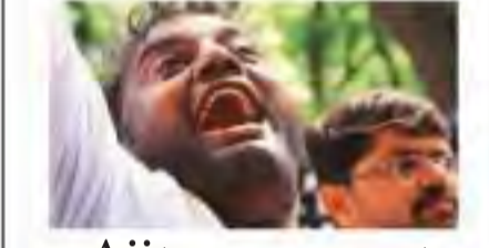
Ajit comes out of Pawar shadow