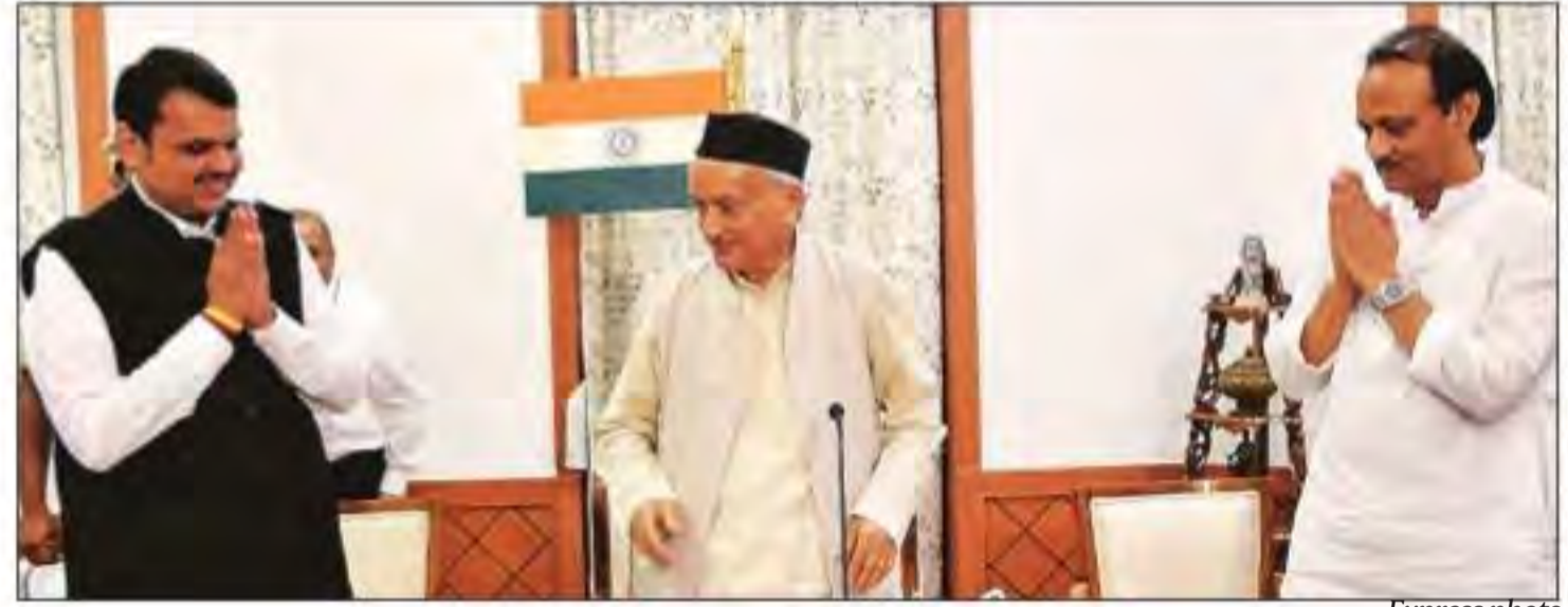
Devendra Fadnavis and Ajit Pawar with Governor Bhagat Singh Koshiyari at Raj Bhavan Saturday; Sharad Pawar and Sena leaders Uddhav, Aaditya Thackeray at a press conference in Mumbai

Maharashtra wakes up to Fadnavis as CM, with a Pawar as his deputy