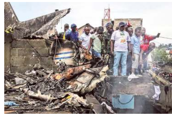
Fatal landing: Rescuers and onlookers amid the debris of a Busy Bee aircraft that crashed in Goma on Sunday.