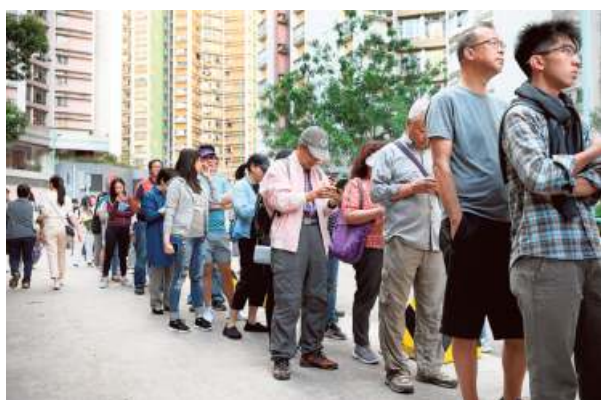
Decisive elections: People line up to vote in the district council elections in South Horizons in Hong Kong.

campaigners gain control, they could secure six seats on Hong Kong's semi-representative Legislative Council and 117 seats on the 1,200-member panel that selects its chief executive.