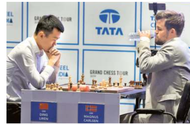
Unstoppable: Magnus Carlsen, right, during his win over Liren Ding on Sunday.

An obviously happy Carlsen made no secret of his delight when reminded of his feat. "In Abidjan, I had good