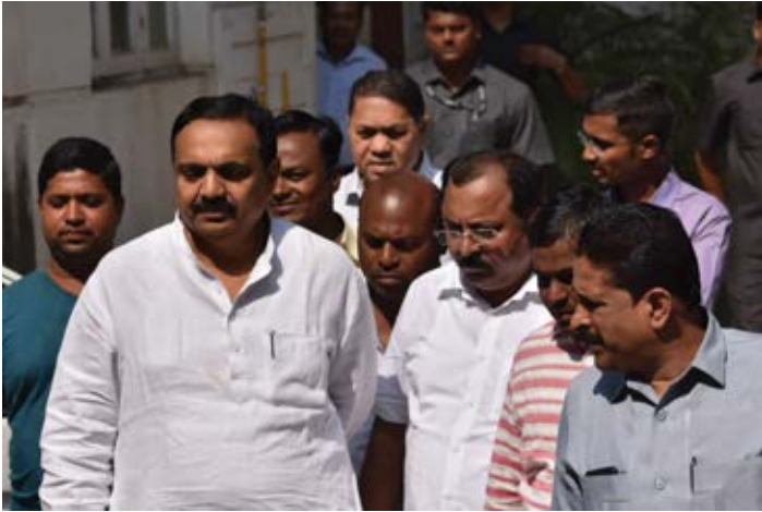
NCP leader Jayant and Dilip Valse Patil come out after meeting Maharashtra deputy chief minister Ajit Pawar at Churchgate in Mumbai on Sunday.