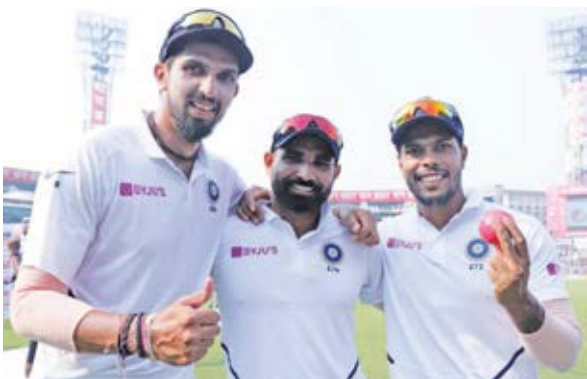
Ishant Sharma, Mohammed Shami and Umesh Yadav.

“We are bowling as a unit and you feel proud as an Indian sitting outside and seeing men at work in such a professional manner. It