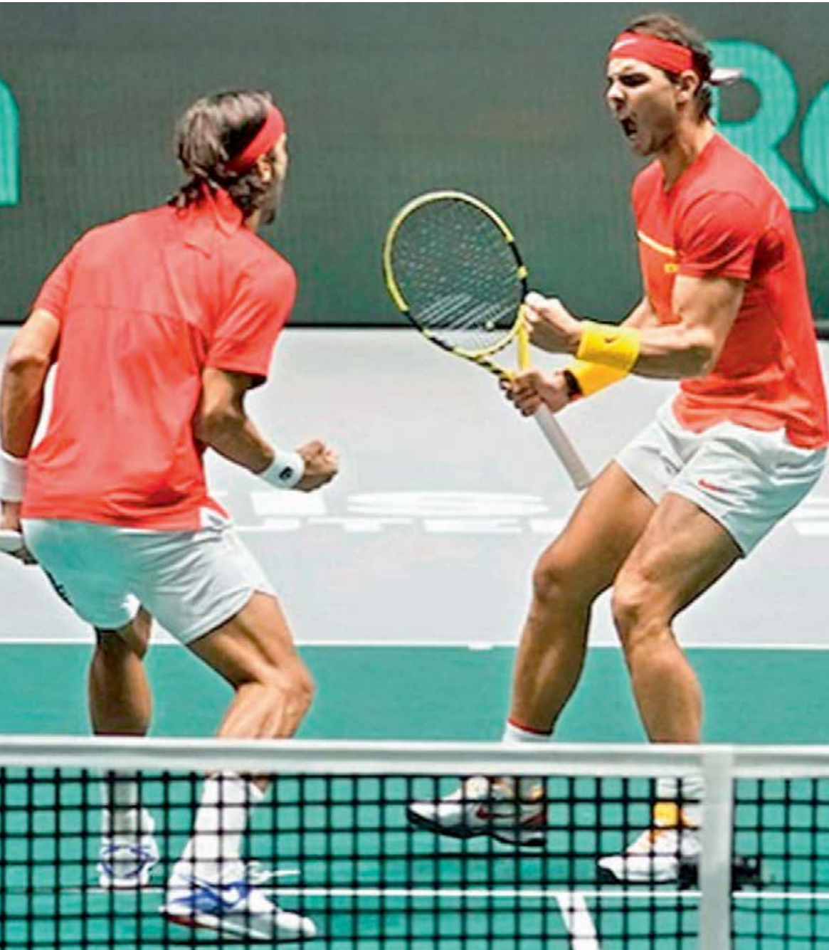
Spain's Feliciano Lopez (left) and Rafael Nadal celebrate after defeating Great Britain's Jamie Murray and Neal Skupski during their doubles semifinal match at the Davis Cup Finals in Madrid on Saturday. Spain won the match 7-6 (7/3), 7-6 (10/8).

It was their third Davis Cup semifinal, after previous last-four defeats in 1913 and 2013. — AFP