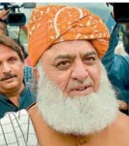
Maulana Fazlur Rehman

The Pak cleric telephoned Ahsan Iqbal and other politicians to attend the important meeting. Meanwhile, the JUI-F chief and PPP chief Bilawal Bhutto agreed to make the committee more active, and spoke about certain political matters. Both leaders are expected to meet in the next few days.