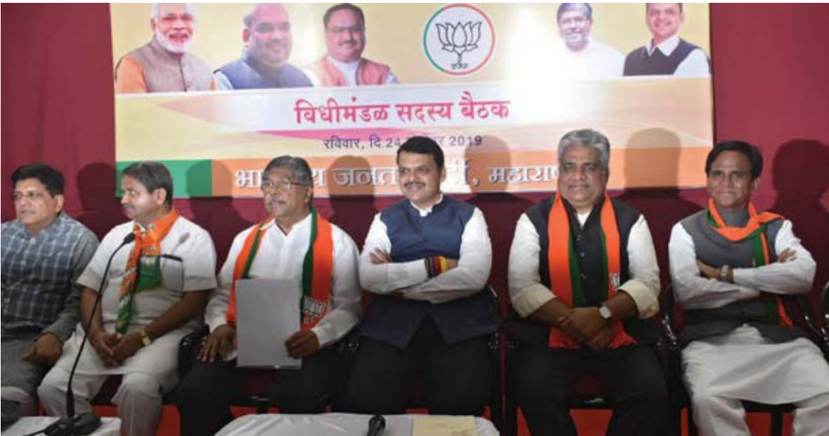
BJP MLA meet in the presence of Maharashtra chief minister Devendra Fadnavis, Chandrakant Dada Patil, Bhupendra Yadav and other leaders at Vasant Smriti in Dadar, Mumbai, on Sunday.