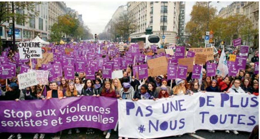
Women hold placards as they march against domestic violence in Paris.

Wearing a traditional Herero dress, Muinjangue spoke of women's empowerment, gay rights and legalising abortion in Namibia.