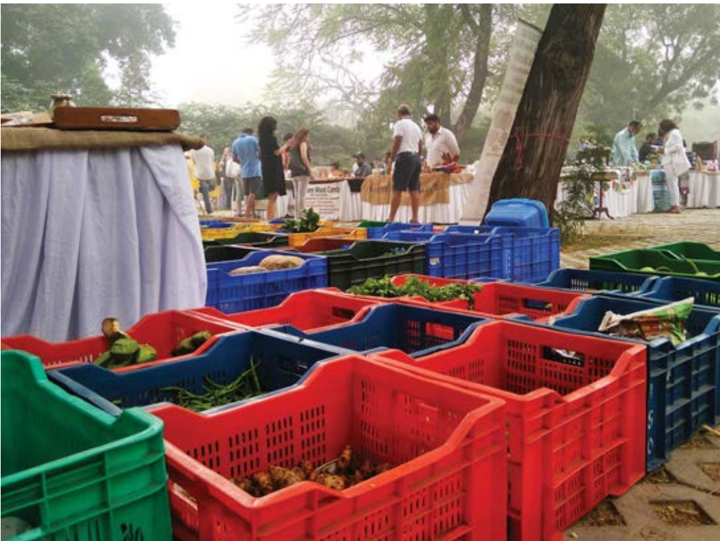
A glimpse of the Sunday organic market at Sunder Nursery near Humayun's Tomb in New Delhi

To be clear — what we are talking of here are not simply raw organic 'produce' markets (though raw produce is available) where the seller spreads out carrots and tomatoes straight from the farm with no exchange of words, other than haggling for price. Be it Chennai, Hyderabad, Chandigarh, Mumbai, Delhi, Bangalore, Ahmedabad, Goa (all cities with urban organic markets), a common trend of weekend organic markets has emerged over the years that are held in malls, farmhouses, restaurants, historic sites and gardens. The products cover a wide range of honey, organic red, black and brown rice (pardon me if I missed a colour), essential oils for the body and soul, home-made muesli, Himalayan pink salt, Kombucha tea, plantation coffee, craft beer and all sorts of other pesticide and preservative free ingredients for your meals. The sellers are an interesting mix of mid-career shifters, energetic young start-ups, retired folk and some very happy and glowing people who wear their brands on their sleeves and look the product (literally, in the case of the essential oils and 'homemade' items). Since the products are sometimes a complete shift from what the regular stores and markets offer, statements like "this honey comes from bees in Himachal that extract nectar from a specific flower known for its benefits", "I source my rice from the Northeast so the lesser known Northeastern farmer can get his due", and the punch line from the white man in the corner who "loves India