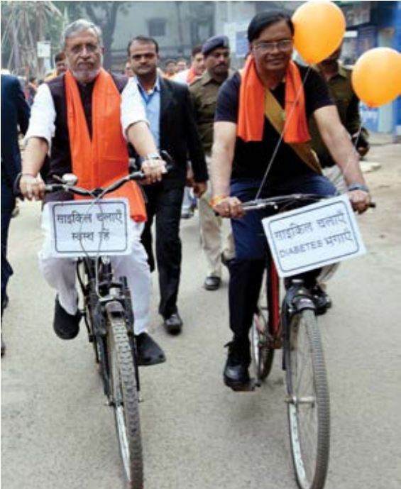
Bihar deputy chief minister Sushil Kumar Modi rides a bicycle during the Fit India Movement, part of Swami Vivekananda Swasthya Cycle Yatra, in Patna on Sunday.

However, he added that this may take some time.