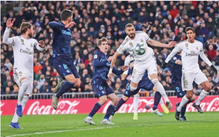
Real Madrid's Karim Benzema (centre) scores against Real Sociedad in their La Liga match at the Bernabeu Stadium in Madrid on Saturday.

goals than Benzema's 25 in the top five European leagues in 2019 and his latest strike means he has 12 for his club this season, twice as many as Cristiano Ronaldo for Juventus. Bale was supposed to fill the void when Ronaldo departed but instead his relationship with the club, coach and now fans has only grown more distant. Zidane defended the 30-year-old when questioned about his celebrations in Cardiff and urged Real Madrid's supporters to show mercy, by pointing to Bale's history and achievements. — AFP