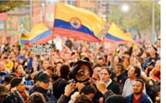
People take part in a protest against the government of Colombia's President Ivan Duque in Bogota. — AFP

Demonstrations were marked by people banging pots and pans in a clamorous protest known as a "cacerolazo," common in parts of Latin America but only a recent phenomenon in Colombia. — AFP