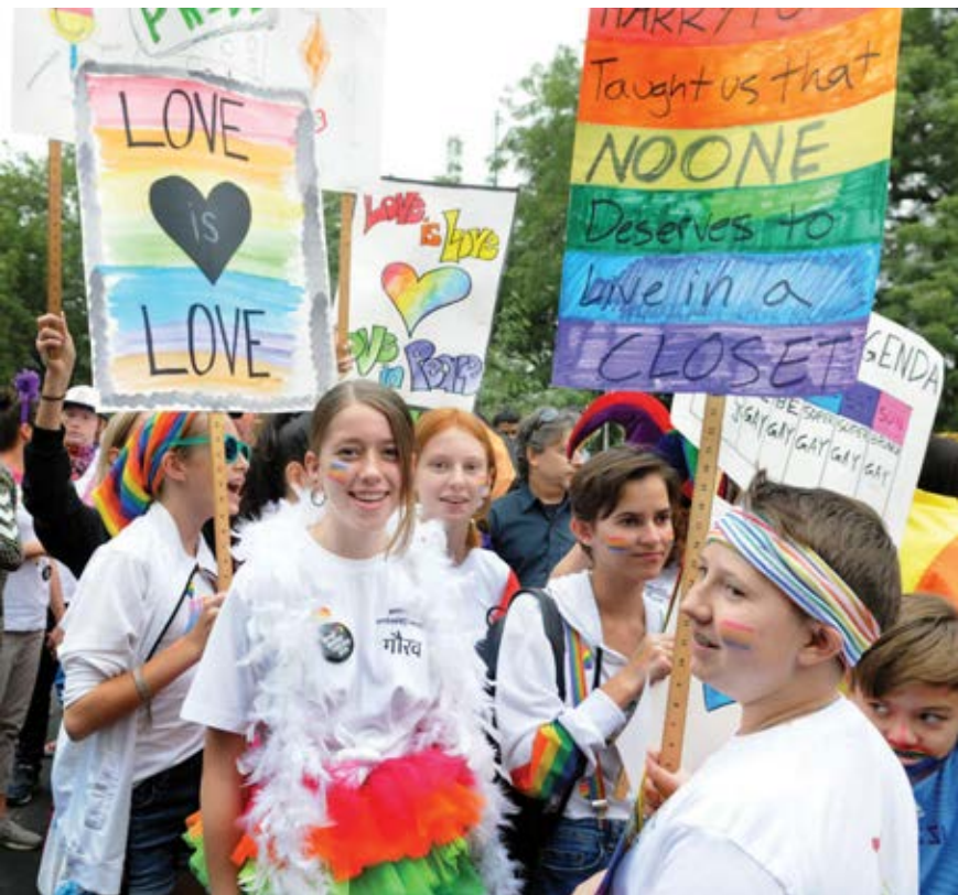
Members and supporters of lesbian, gay, bisexual and transgender community hold placards during a pride parade in New Delhi on Sunday.

Following protests, the varsity had announced a "partial" rollback and removal of clauses pertaining to the dress code and curfew but the students dubbed it as "eyewash." They have been demanding a complete "rollback" of the manual.