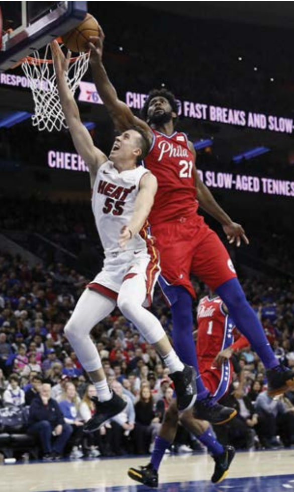
Joel Embiid (right) of Philadelphia 76ers blocks a shot by Duncan Robinson of Miami Heat during their NBA game in Philadelphia on Saturday. The 76ers won 113-86.

Kasper Dolberg pulled one back for the visitors with 12 minutes remaining, but Nice defender Patrick Burner was also dismissed late on and Lyon claimed all three points.