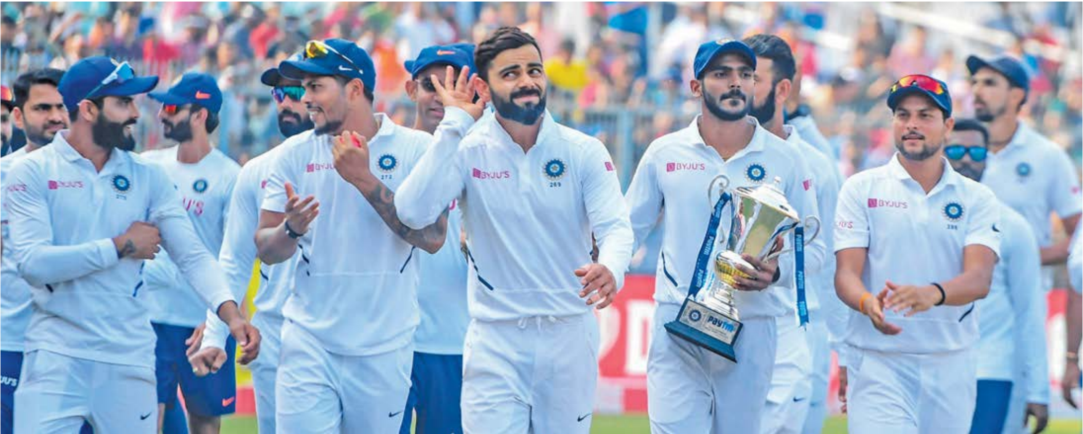
Skipper Virat Kohli leads the team out for a lap of honour around the Eden Gardens after completing a 2-0 whitewash against Bangladesh.

Mount Maunganui: England were battling for survival after Mitchell Santner took three cheap wickets following a match-turning double century by BJ Watling in the first Test against New Zealand on Sunday. After New Zealand declared at 615 for nine on day four in Mount Maunganui, England were 55 for three at stumps, needing a further 207 on the final day if they are to make the Black Caps bat again. Watling swung the match firmly New Zealand's way with his Test best 205 and a record-breaking partnership with Santner who scored a maiden century and then capped his remarkable day by taking three wickets for six runs. “It’s not going to be easy to get seven wickets on that (pitch),” Santner said. England wicketkeeper Jos Buttler blamed scoreboard pressure for the tourists’ predicament after they had held the upper hand when New Zealand were 197 for five before Watling’s marathon effort kept them in the field for a tiring 201 overs. That’s a big learning point for us. Just when you think you’re getting to the place you need to be, and doing the hard work, there’s a lot more hard work to come,” he said. — AFP Brief scores: England 353 & 55/3 in 27.4 overs (Rory Burns 31, Joe Denly (batting) 7; Mitchell Santner 3/6) vs New Zealand 615/9d in 201 overs (BJ. Watling 205, Mitchell Santner 126; Sam Curran 3/119, Ben Stokes 2/74).