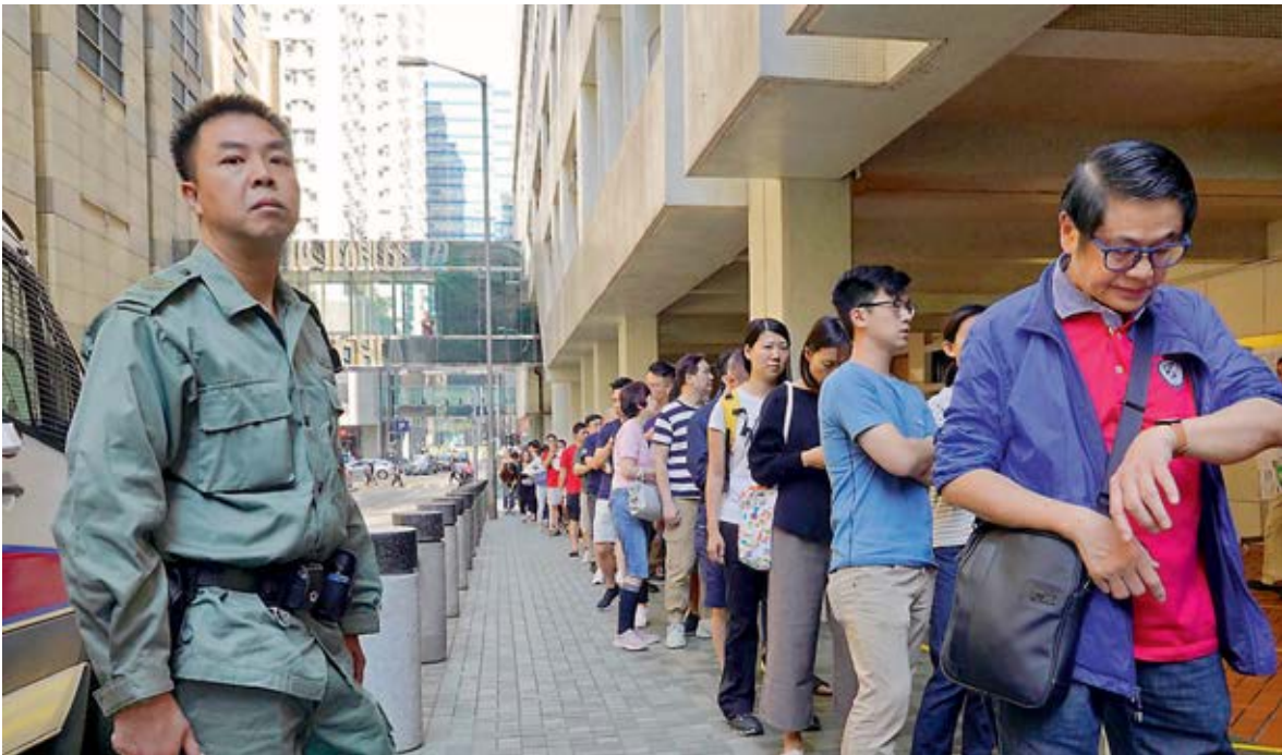
People queue to cast their vote during the district council elections in North Point in Hong Kong on Sunday.