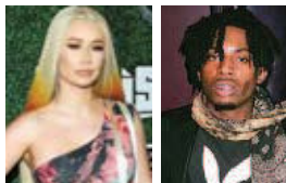
Iggy Azalea Cardi

had made all sorts of arrangements for safety of these aquatic animals. According to reports, as many as 18 camps have been set up and over 50 forest officials have been deployed to protect the Olive Ridelys. Besides, two temporary camps have been built at Babubali and Agarnasi islands.