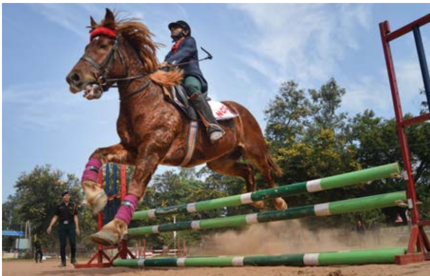
An NCC cadet displays his skills during the National Cadet Corps Day in Jabalpur on Sunday.

The ban on NDFB comes with immediate effect and will last for five years, said a senior official of the Union home minister. The ministry said the group has been indulging in extortion of money from various sections of the society to finance and execute its plans to create a separate Bodoland.