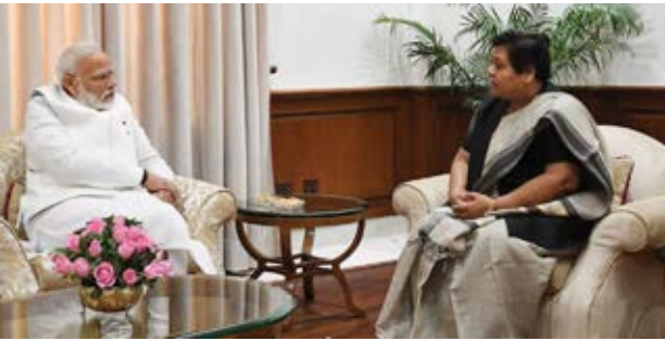
PM Narendra Modi with Chhattisgarh governor Anusuiya Uikey during a meeting in New Delhi on Sunday.

When one of the cadets asked him "had you not been a politician, what would you have been," Mr Modi described it as a "difficult question". "Now this is