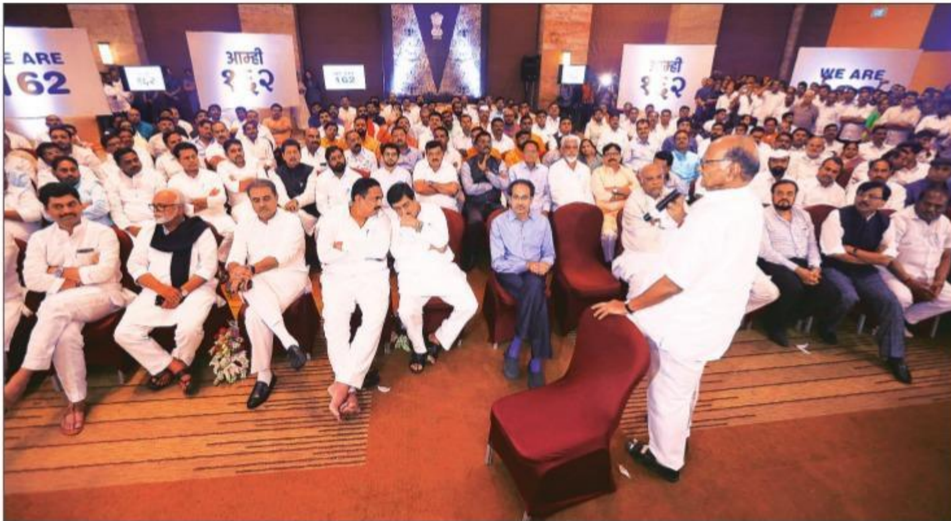
Shiv Sena, NCP and Congress leaders with their MLAs at the Grand Hyatt Hotel in Mumbai on Monday.