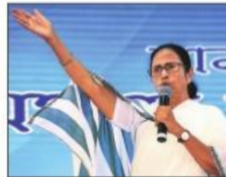
'Since 1971, they have been without a home or land'

In January, the TMC government had given freehold land rights to residents of 94 refugee colonies which were on state