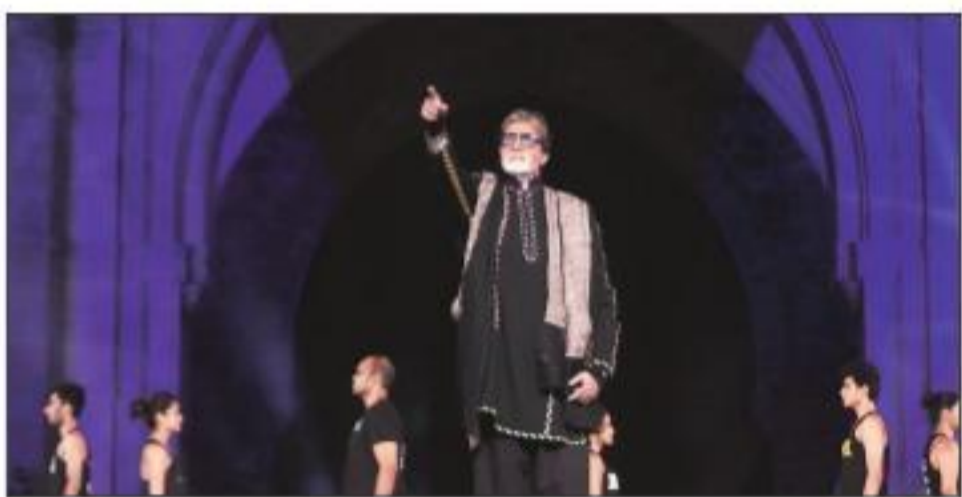
Rajnath, Gadkari to be chief guests; Amitabh Bachchan rehearses for the event in Mumbai on Monday.

In its fourth edition that coincides with the 150th birth anniversary year of Mahatma Gandhi, the event will showcase inspiring stories of courage, for-