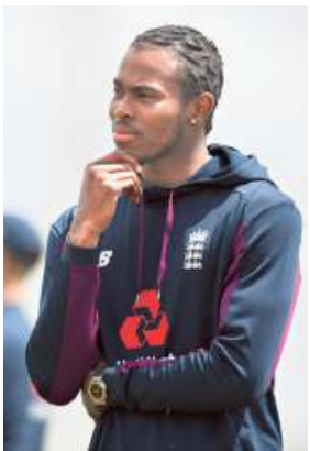
Jofra Archer.