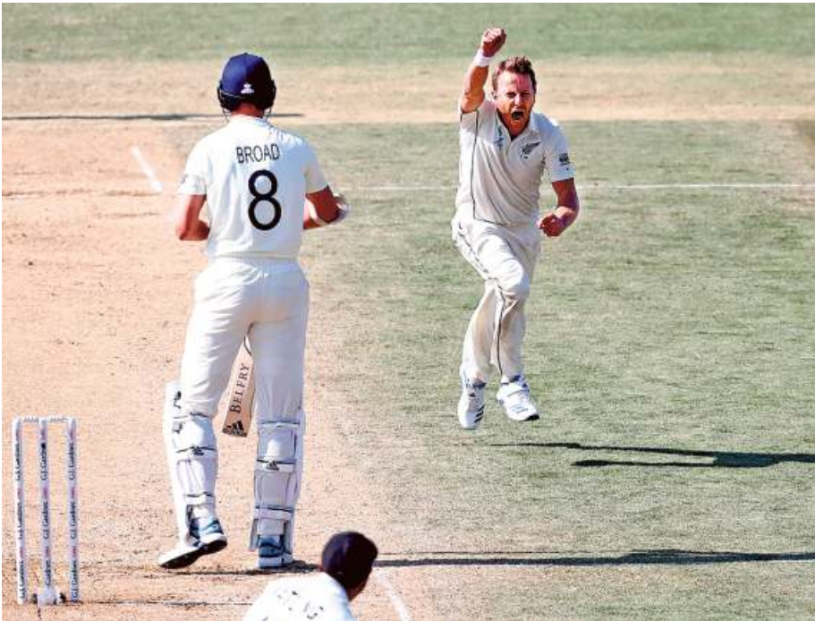
The final nail: Neil Wagner is gung-ho after trapping Stuart Broad in front.

New Zealand's celebrations, however, were tempered by injury, with Trent Boult bowling just one over in the morning before leaving the field with a rib problem and taking no further part.