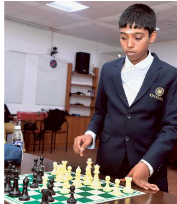
Grandmaster at work: R. Praggnanandhaa playing chess at The Hindu office in Chennai on Monday.

"Maintaining my Elo rating is equally important," said the prodigy after toying and beating 10 amateur players from The Hindu in 45 minutes in a fun-filled session of simultaneous chess at