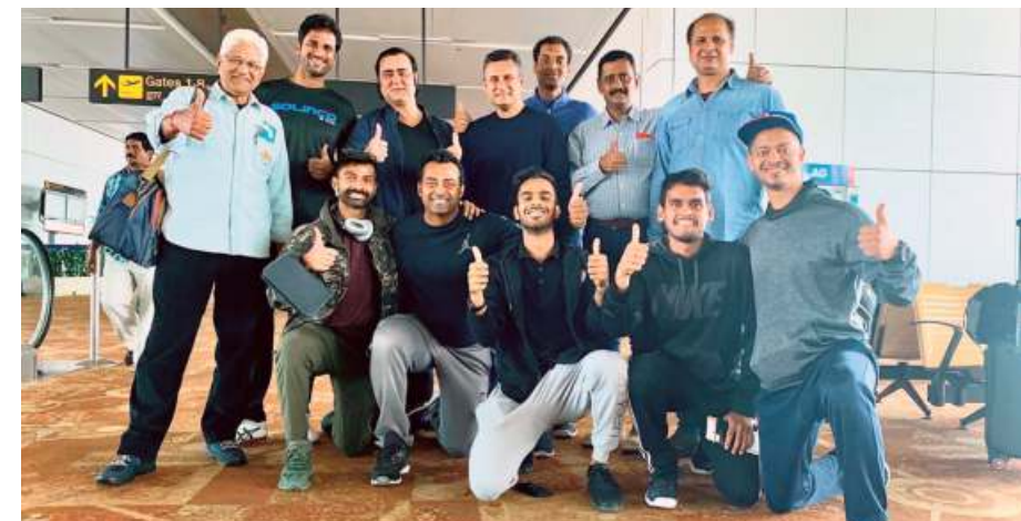
All set: The Indian team is all smiles as it gets ready to depart for Kazakhstan.

"We have very good doubles players in our country. We have two guys in top-50. I don't look at it as holding back. Tennis is a journey. I am 30-years-old, I enjoy playing on Tour, regardless of