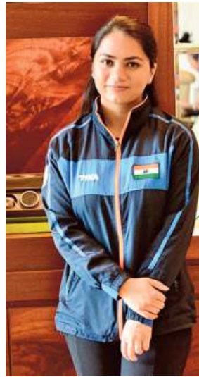
Apurvi Chandel.