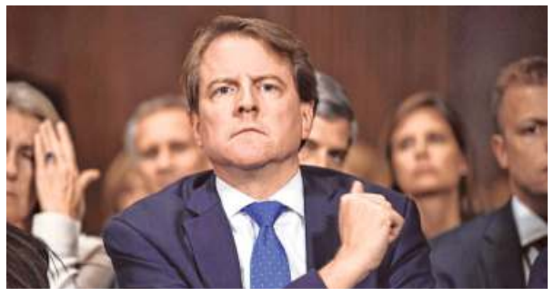
No immunity: Donald McGahn in Washington.

"Per the Constitution, nobody is above the law," Judge Ketanji Brown Jackson said in her 120-page opinion issued on Monday. Current and former presidential aides have to comply with "valid legislative subpoena" from a "duly authorised committee of Congress", the judge said. The ruling pertains to a case from August, in which the House Judiciary Committee had gone to court to get