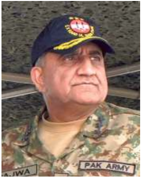
Gen. Qamar Javer Bajwa

The court suspended the notification based on technicalities. The Chief Justice maintained that the summary and approval of the Army Chief's extension "is not correct". On August 19, the Prime Minister's office issued a notification saying that the Army Chief's tenure had been extended for another term of three years from the date of completion of current tenure.