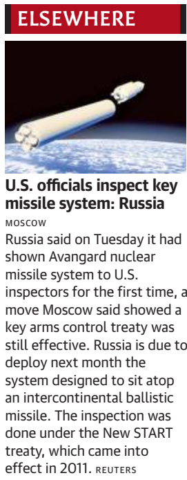
ELSEWHERE U.S. officials inspect key missile system: Russia

MOSCOW Russia said on Tuesday it had shown Avangard nuclear missile system to U.S. inspectors for the first time, a move Moscow said showed a key arms control treaty was still effective. Russia is due to deploy next month the system designed to sit atop an intercontinental ballistic missile. The inspection was done under the New START treaty, which came into effect in 2011. REUTERS