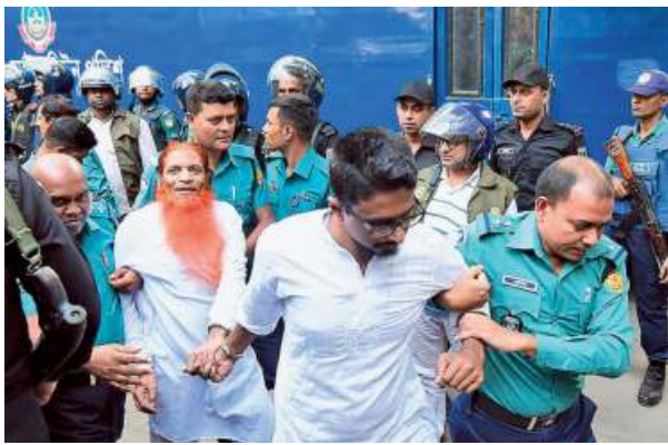
Islamist militants being taken to court for trial in the Holey Artisan Bakery attack case in Dhaka on Wednesday.

One of the eight accused was acquitted, he added. A defence lawyer said the convicted men would appeal the charges, which include training the attackers and supplying arms, explosives and funds. After the ruling, they shouted "Allahu Akbar" (God is Greatest) and "We did nothing wrong" from the