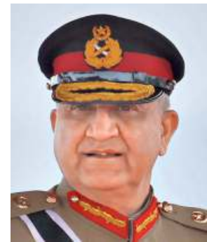
Gen. Qamar Javed Bajwa

Justice Khosa said that even an assistant commissioner is not notified the way the government handled the Army chief's extension notification.