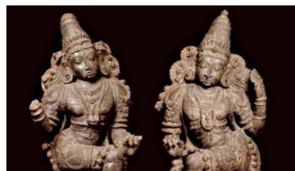
Historic links: Three artefacts, a pair of 'Dwarapala' and a 'Nagaraja', will be returned to India.

'Deep relationship' "Like India, we understand the value of our ancient cultures and artefacts," the Aus-