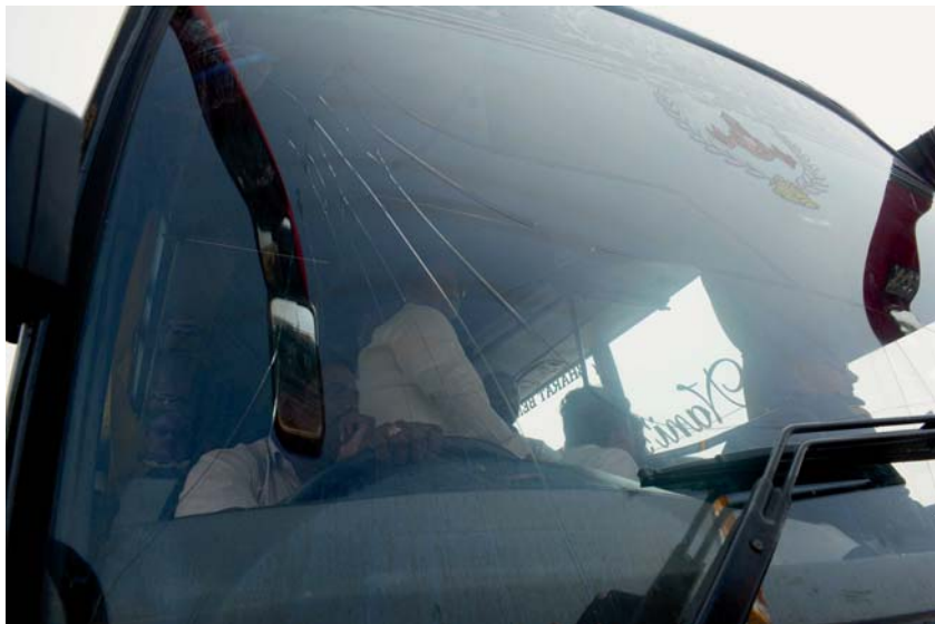
The windscreen of the bus in which TD president N. Chandrababu Naidu was travelling suffers a crack after it was pelted with stones. — DC

Farmers erected black flexes and banners. They also carried placards and gathered in