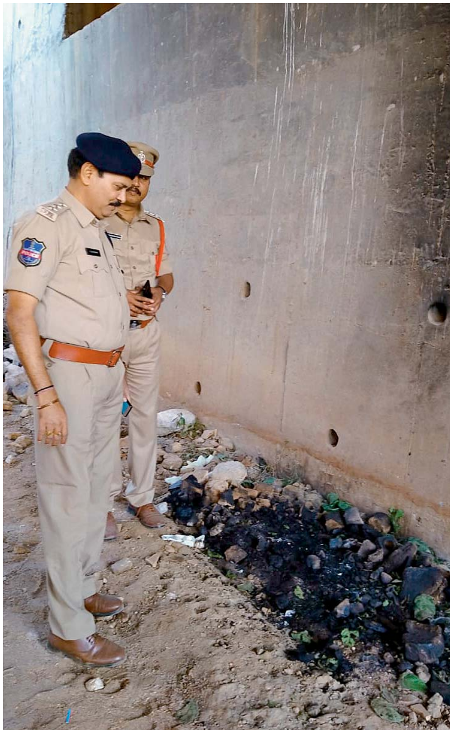
Police inspect the spot where the doctor's body was allegedly burnt on the outskirts of Chattanpally village in Shadnagar mandal, on Thursday.

The Shadnagar police said that the body was covered in a rug and was set ablaze. A scarf was found a few feet away from the body. The police asked the family members to come to the spot for identifying the body. Upon seeing the scarf and a pendant of Lord Ganesh around her neck, they confirmed it