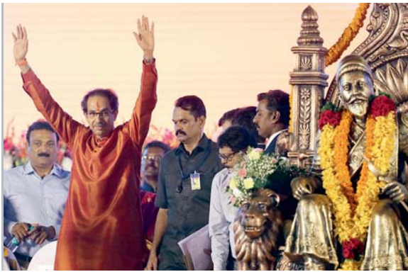
Maharashtra Chief Minister Uddhav Thackeray waves to supporters in Mumbai on Thursday.

Shiv Sena chief Uddhav Thackeray was on Friday sworn in as the chief minister of Maharashtra amid a galaxy of national political dignitaries and business tycoon Mukesh Ambani and his family as half a lakh people looked on at Shivaji Park in Mumbai. He took oath as the Chief Minister of Shiv Sena - Congress - NCP alliance Maha Vikas Aghadi (MVA), which also declared its common minimum programm (CMP) stating that the alliance will "uphold the secular values enshrined in the Constitution". Fireworks were set off as the proceedings began as Sena supporters raised slogans and clicked pictures, joyous at the sight of one of their partymen