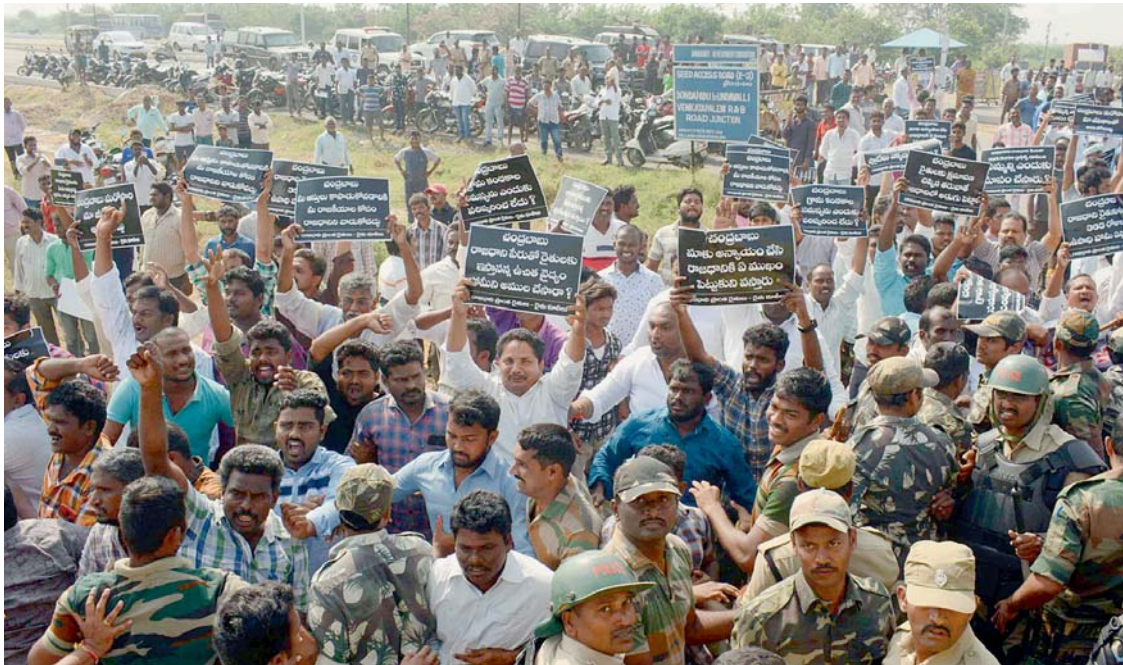
Police personnel try to prevent Dalit protesters from approaching the convoy of TD president N. Chandrababu Naidu during a tour of the AP capital region, near Venkatapalem in Guntur district.

The present dispensation also strongly feels that the previous TD government had laid the foundation stone to establish a steel plant at Kadapa hurriedly without any plan to raise funds and that the previous government had also not effectively worked with the union government to ground the project.