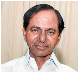
K. Chandrasekhar Rao

Mr. Rao said that the Cabinet had resolved to bring an Ordinance to appoint chairpersons to 28 government-owned corporations including the Rythu Samanvaya Samiti.