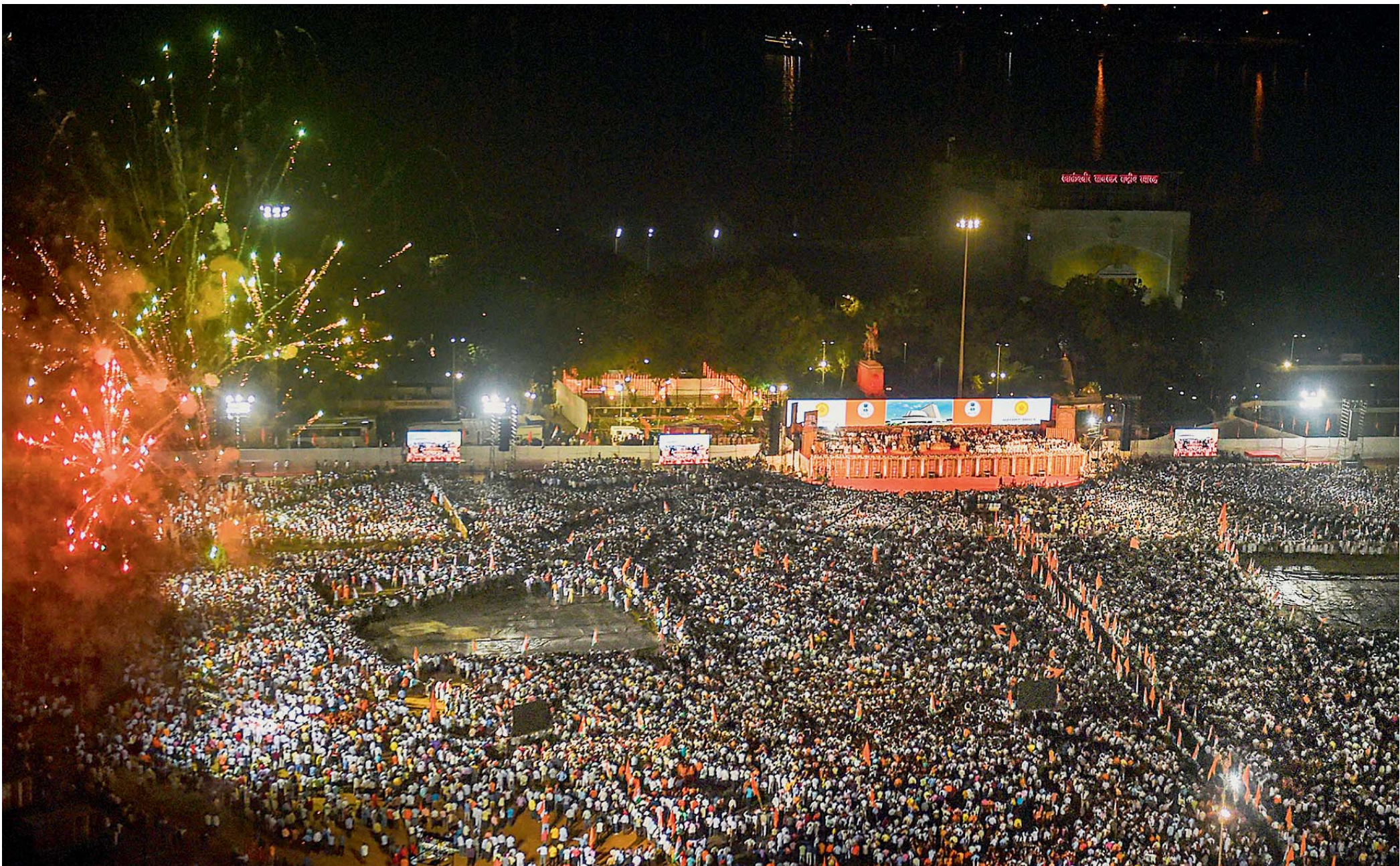
Aerial view of Shivaji Park during the Maharashtra ministry swearing-in ceremony in Mumbai on Thursday.

An editorial in Saamana acknowledged Sharad Pawar's efforts in taking the Sena-NCP-Congress alliance forward. The NCP chief has been credited for the u-turn by his nephew and is being described as the state political drama's 'man of the match'.