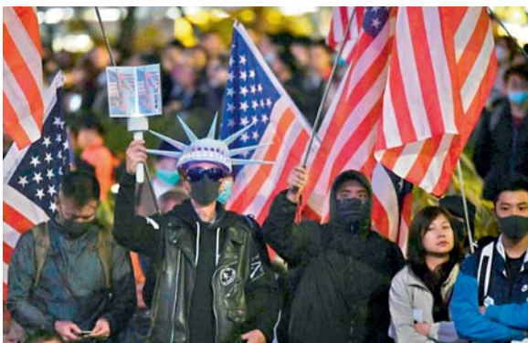
People assemble for a gathering of thanks at Edinburgh Place in Hong Kong.