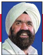
Sant Rajinder Singhji

News reports we receive through TV, newspapers, magazines, blogs, the Internet, smartphones, tablets or other devices always contain breaking news about a catastrophe in some part of the world. There are always difficulties and problems receiving attention in the local, national or international news. It's hard to go through a single day without hearing of the suffering other people are undergoing. Is that all life is — but a series of disasters strung together? Is there any cure for the