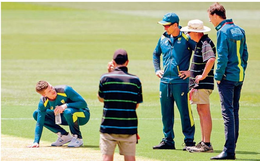
Australian captain Tim Paine inspects the pitch on the eve of the second Test match against Pakistan in Adelaide.

Bancroft's departure to play for Western Australia in Perth means there will be no immediate batting substitute in case of a concussion.