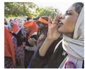
The law criminalised wearing revealing clothing and drinking alcohol.

The Public Order Act was first passed in 1992 by al-Bashir's Islamist government and enforced only in the