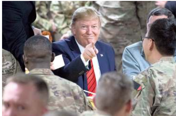
Unexpected guest: Donald Trump making a gesture at 'Thanksgiving' dinner with troops in Kabul on Thursday.

Ceasefire key to talks "We say it has to be a ceasefire and they didn't want to do a ceasefire and now they want to do a ceasefire, I believe. It will probably work out that way," he said.