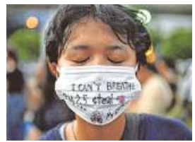
Global climate protests kick off in Sydney

Protesters across Asia kicked off a fresh round of global demonstrations against climate change on Friday, with bushfire-ravaged Australia taking the lead. Protesters in several Asian cities, including Delhi, heeded the call to action from 16-year-old climate activist Greta Thunberg. The protests have taken on extra urgency in Australia — the country's southeast has been devastated by bushfires in recent weeks.