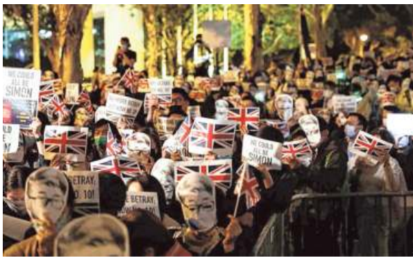
Pro-democracy agitators outside the British Consulate in Hong Kong on Friday.

"If the communist Hong Kong government ignores public opinion, we will blossom everywhere for five or six days straight... We have to set a deadline," read one post on the Reddit-like