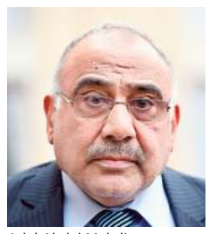
Adel Abdel Mahdi

"It's our first victory, and we're hoping for many