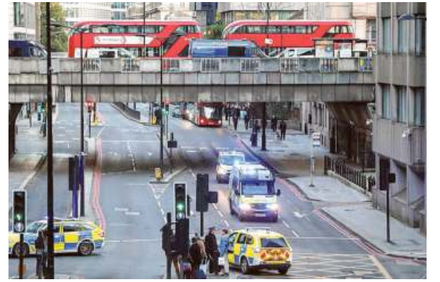
London in panic: Police vehicles and buses near the London Bridge on Friday.