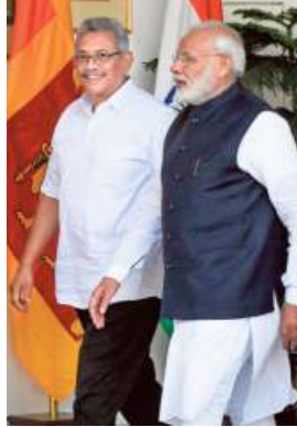
PM Narendra Modi with Sri Lankan President Gotabaya Rajapaksa in New Delhi on Friday.