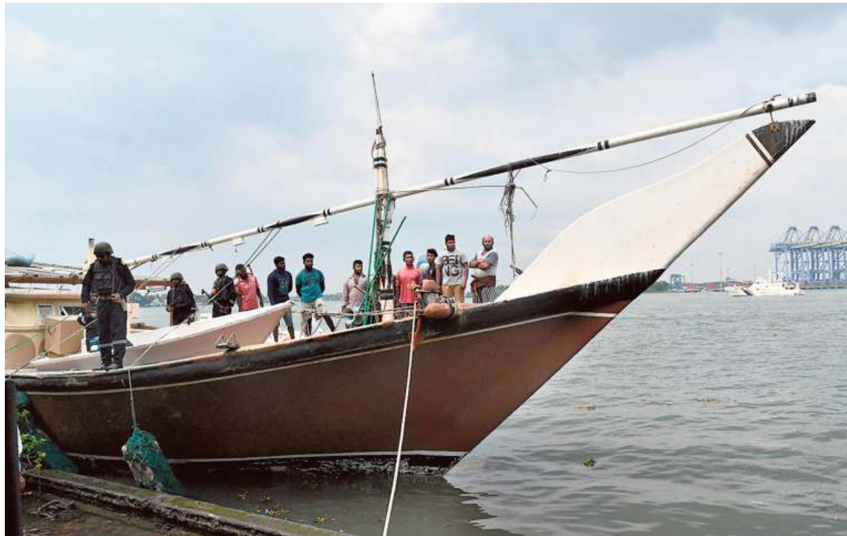
Perilous journey: Nine Indian fishermen who escaped from Yemen following 'inhuman treatment' by their sponsor, being escorted by the Coast Guard at Fort Kochi on Friday. They set sail on November 19 after stocking up on supplies. (REPORT ON PAGE 8)