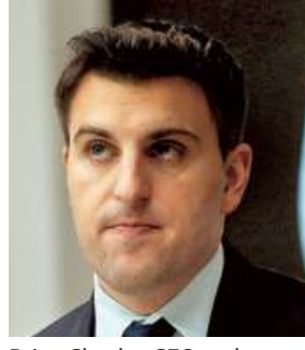
Brian Chesky, CEO and co-founder of Airbnb.

"Starting today, we are banning 'party houses' and we are redoubling our efforts to combat unauthorised parties and get rid of abusive host and guest conduct, including conduct that