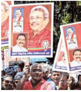
Supporters of Gotabaya Rajapaksa at a rally in Bandaragama.

"After considering many representations by several parties that my order was