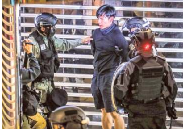
Riot act: Policemen arresting a protester inside the City Plaza mall in the Tai Koo Shing area in Hong Kong on Sunday.

Restaurant vandalised Police said protesters had vandalised a restaurant after a peaceful chanting of slogans. Several people were wounded, one man in a white tee-shirt being beaten