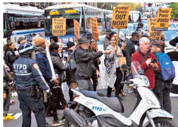
Not my President: A protest against U.S. President Donald Trump in New York on Saturday.

Kiev entered Democratic Party servers and planted evidence to frame Moscow, believed Trump aide