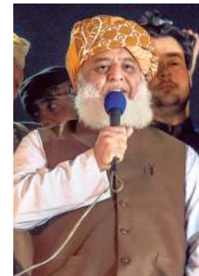
JUI-F leader Maulana Fazlur Rehman during the 'Azadi March' in Islamabad.

"We are trying to find a middle ground so that both the government and the Op-