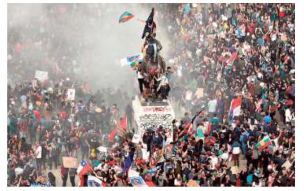
Spiralling protests: People protesting against Chile's government in Santiago on Monday.

scribed the mass mobilisation as the enemy's declaration of war on the state, call the military on to the streets, impose night-time curfews and extended the emergency to counter large-scale destruction of property.