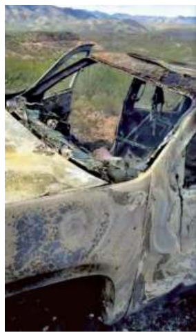
The wreckage of a vehicle torched by Mexican cartel members.

Mexican officials said six children were wounded and another girl missing after the attack, which left the family's three cars riddled with