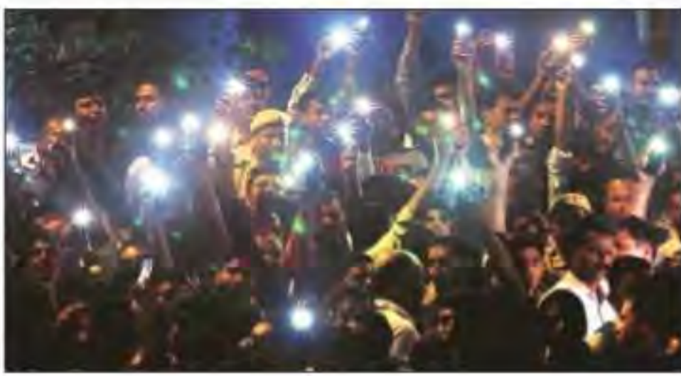
Police personnel protest outside Delhi Police headquarters, Tuesday.