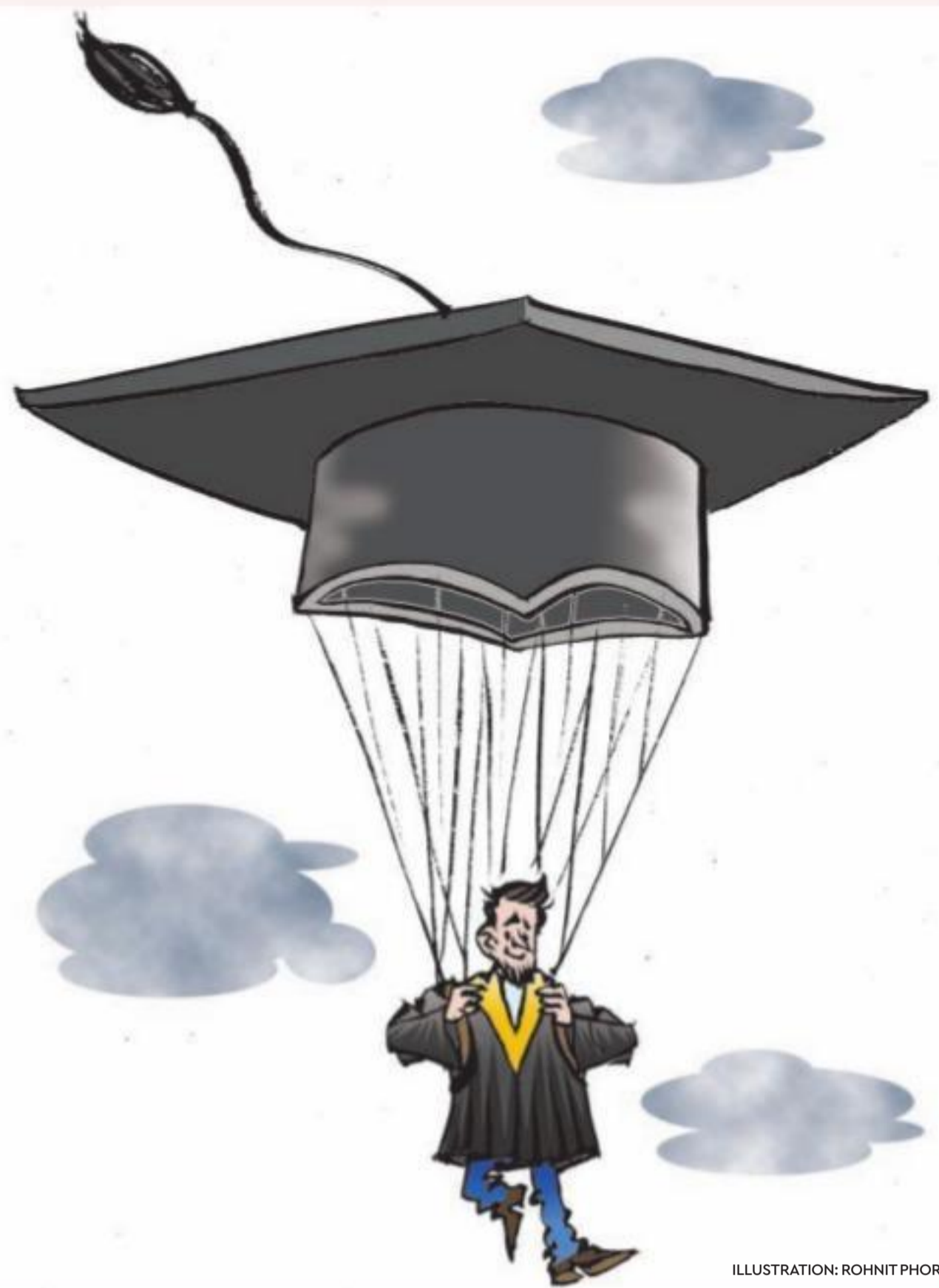
ILLUSTRATION: ROHNIT PHORE

Enrollment of Muslim women in higher education rose faster than men's between 2012-13 and 2018-19—8.7% vs 6.9%. Total enrollment increased from 5.85 lakh to 9.66 lakh for women and 6.67 lakh to 9.93 lakh for men, as shown in accompanying table. In the