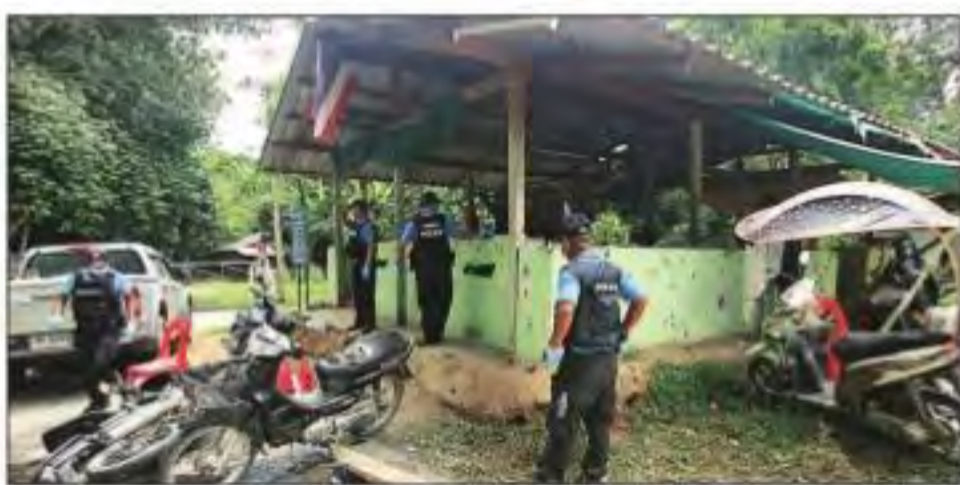
The site where village defence volunteers were killed by suspected separatist insurgents in Yala province.

The attackers, in the province of Yala, also used explosives and scattered nails on roads to delay