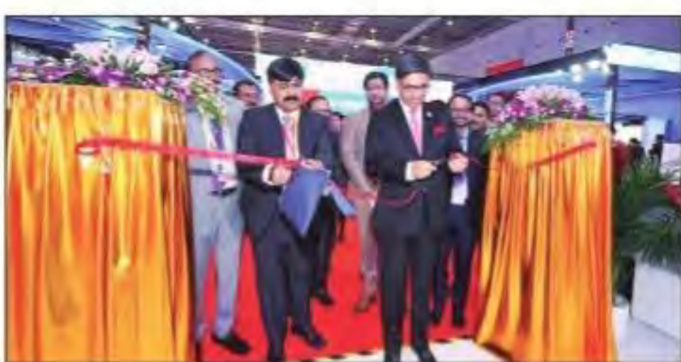
India's ambassador to China, Vikram Misri, inaugurates the Indian pavilion at the expo.

An increase in seafood consumption domestically in China and a rejig of trade relationships owing to the US-China trade wars have worked in India's favour, said Marine Products Export Development Authority deputy