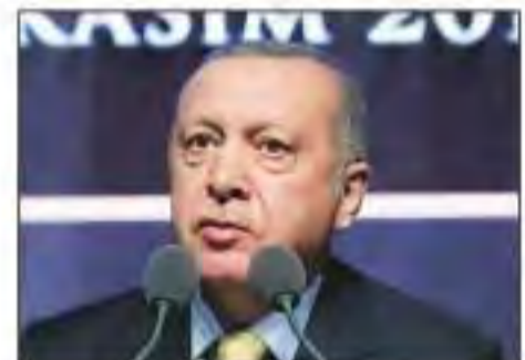
RECEP TAYYIP ERDOGAN Turkey President

Kansas City: Kansas City voters on Tuesday approved removing Dr Martin Luther King's name from one of the city's most historic boulevards, less than a year after the city council decided to rename The Paseo for the civil rights icon. Those who pushed for the change celebrated when the street signs went up, which appeared to end Kansas City's reputation as one of the largest US cities without a street named for him. But a group of residents intent on keeping the historic Paseo name began collecting petitions to put the name change on the ballot and achieved that goal.