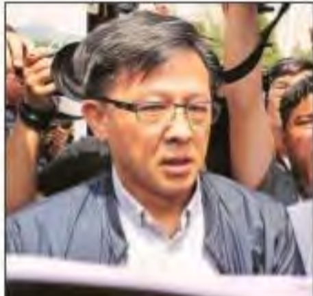
Junius Ho survived the knife attack.

At a news conference Wednesday in Beijing to wrap up her visit to mainland China, Hong Kong's embattled leader, Carrie Lam, condemned the attack on Ho and said she was concerned over rising public proclivity for violence. “How can protesters carrying out violent acts claim to be pursuing freedom and democracy? Their every move challenges the freedom and violates the rights of the majority of the