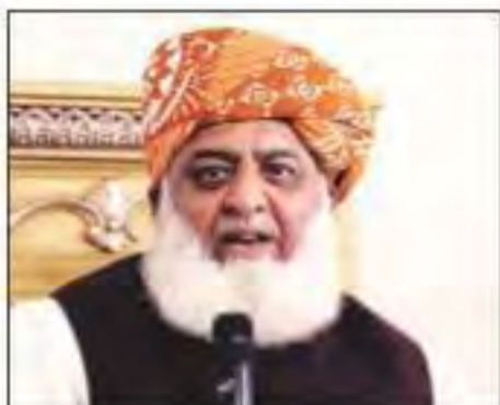
Fazlur Rehman said the protest was being held to fulfil a “national responsibility”.

Earlier, after his meeting with Punjab Assembly Speaker Chaudhry Pervaiz Elahi, Rehman said: “the stage for a positive reply has not yet arrived”.