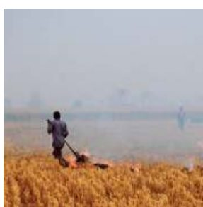
A farmer burns paddy stubble on a farm on the outskirts of Amritsar on Wednesday.