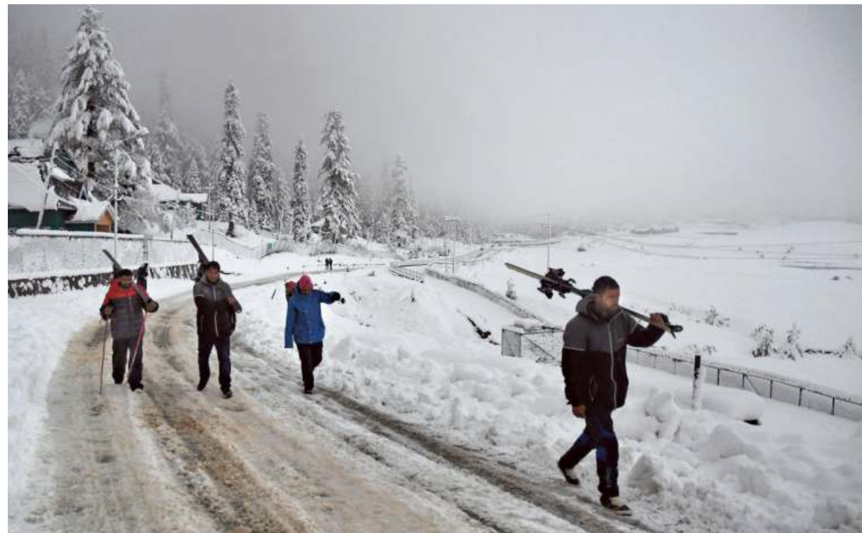
Chilling out: Tourists get ready for skiing during the first spell of snow in Gulmarg, north Kashmir, on Wednesday.