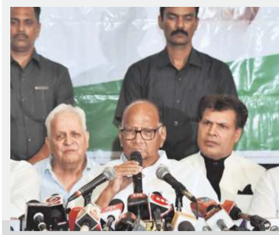
No deal: NCP president Sharad Pawar addressing a press conference in Mumbai on Wednesday.

Meanwhile, a meeting between Union Minister for