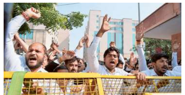
Lawyers protesting against the Delhi police at the Saket Court Complex in New Delhi on Wednesday.

The issue has since snowballed, with thousands of