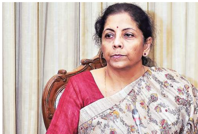
Finance Minister Nirmala Sitharaman may announce rationalisation of tax slabs for the salaried class in the next Budget to boost consumption

This means if a business declares a turnover of ₹1 crore, tax