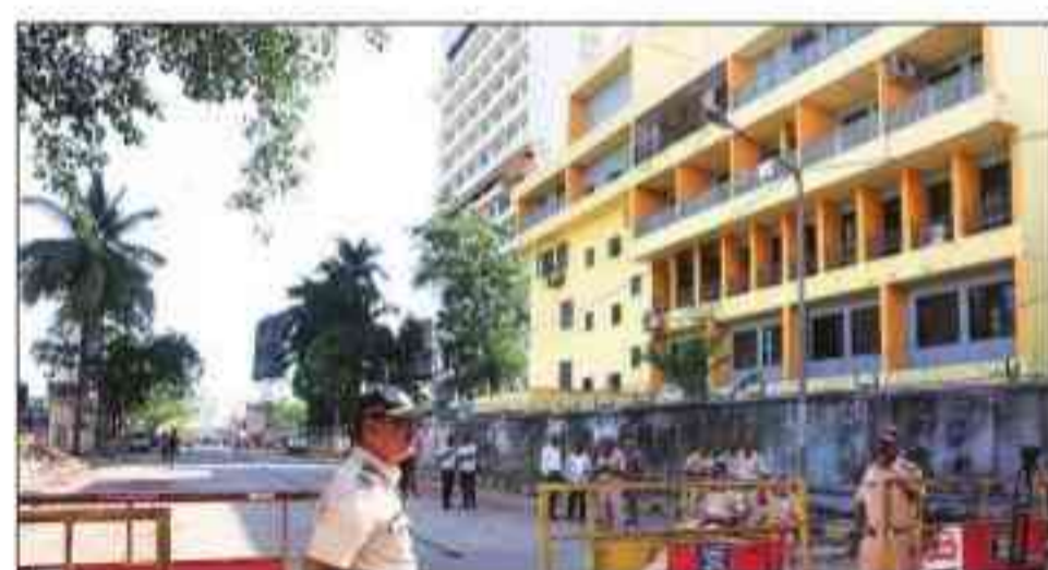
Security outside Hotel Rang Sharda in Bandra.