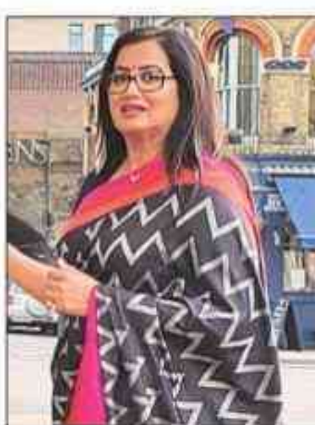
Her phone 'tapped' during Lok Sabha elections

During campaigning in March, audio clips of phone conversations of members in her camp were released in the pub-