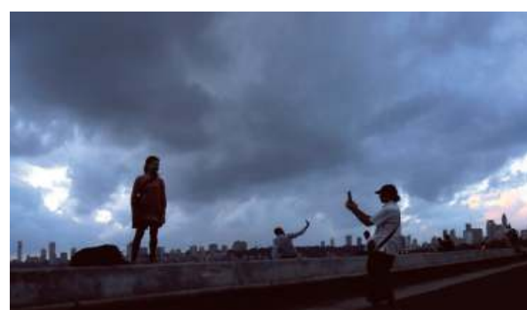
Cloudy skies: According to IMD, moderate rainfall is expected due to Cyclone Maha's impact. •EMMANUAL YOGINI

"Prisons are over-occupied at 114%, where 68% are undertrials awaiting investi-