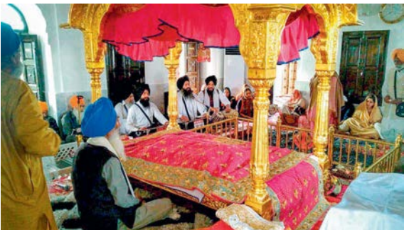
Devotees offers prayer at Gurdwara Kartarpur Sahib in Pakistan on Friday.

“Most people are buying items like rice, dal and flour in bulk. The demand is such that we have been asking our dealers to rush additional stocks. This is not normal,” says Kailash Agrawal, who runs a grocery store at Faizabad