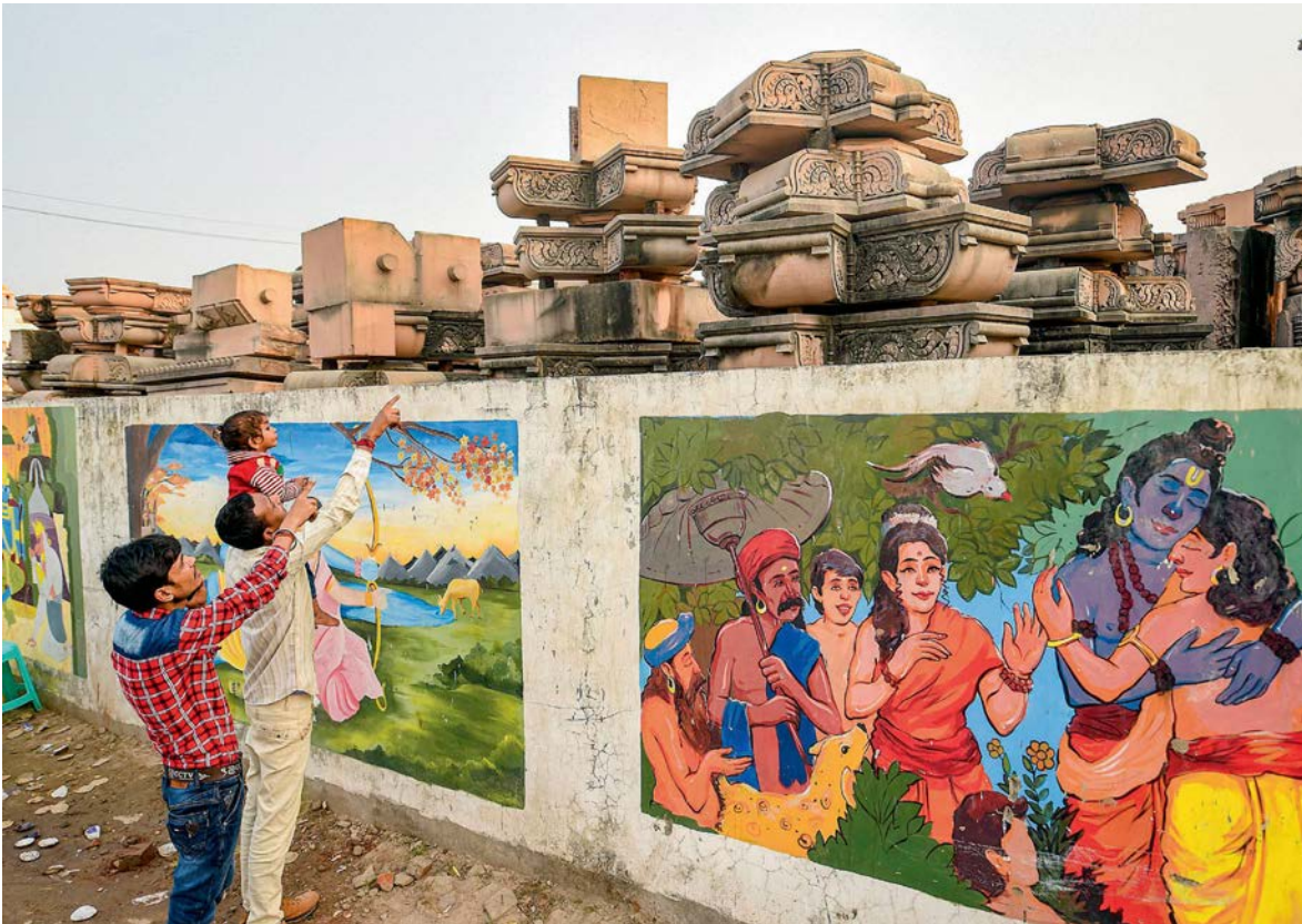
Tourists visit Ramjanmabhoomi Nyas kaaryashala in Ayodhya on Friday.

Taseer, the son of Indian journalist Tavleen Singh and the late Pakistani politician Salman Taseer, has become ineligible for an OCI card as it is not issued to any person whose parents or grandparents are Pakistanis and he hid this fact, a Union home ministry spokesperson has said.