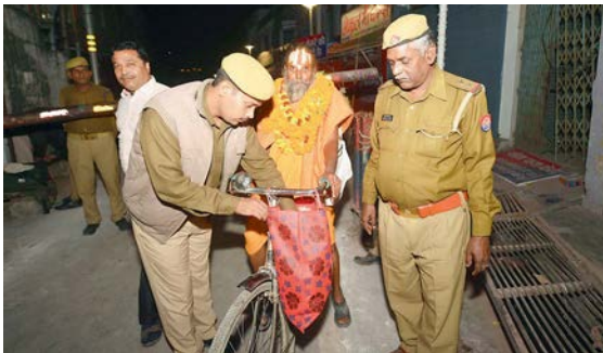
Police personnel conduct searches near the site of disputed Ram Janmabhoomi-Babri Masjid site, in Ayodhya on Friday.