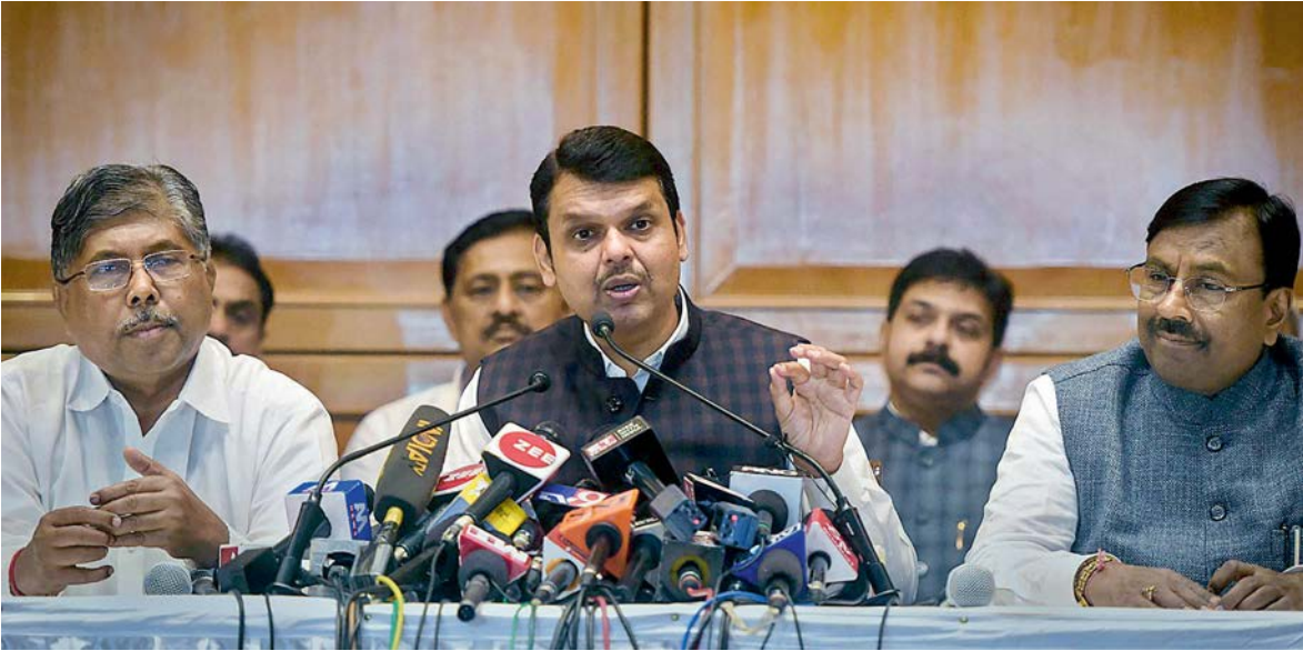
Maharashtra CM Devendra Fadnavis flanked by senior BJP leader Sudhir Mungantiwar (L) and Maharashtra BJP president Chandrakant Patil (R) in Mumbai on Friday.

Addressing Sena's claim about the sharing of the Chief Minister's post he said that no such promise was made. "Let me again make it very clear that no decision was taken on the Chief Minister's post in my presence. In fact, we had broken off the talks on this issue. I was present at all the deliberations. Subsequently, the talks resumed but we never discussed sharing of the Chief Minister's post for