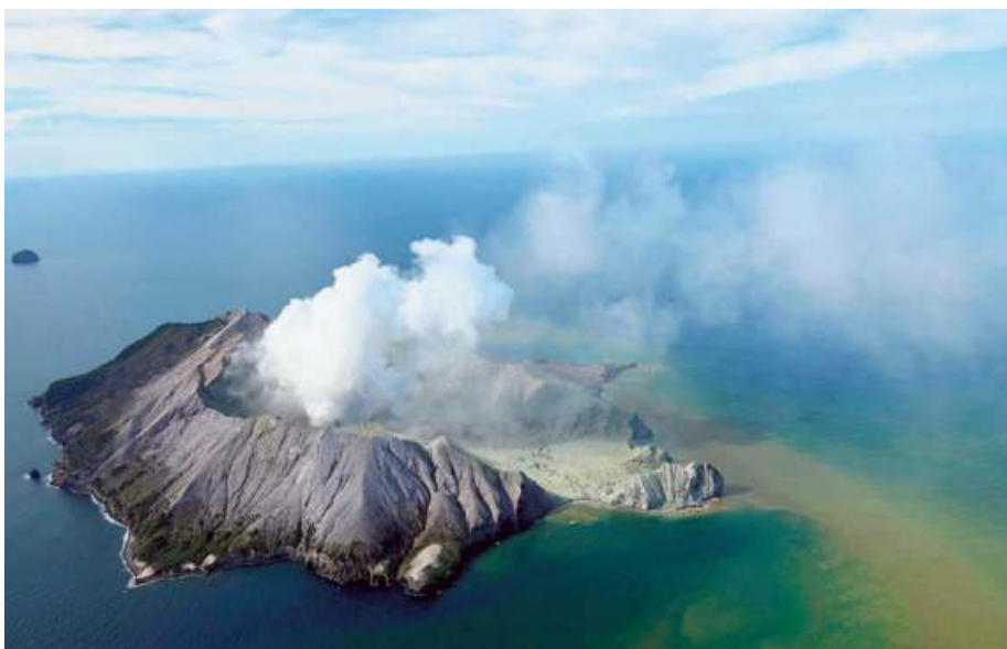
An aerial photo of White Island after the volcanic eruption in New Zealand on Monday.

"Based on the information we have, we do not believe there are any survivors on the island," police said in a statement.