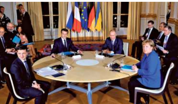
Key talks: (From left) Ukraine's Volodymyr Zelensky, France's Emmanuel Macron, Russia's Vladimir Putin and Germany's Angela Merkel in Paris on Monday.

The four-way talks are expected to be followed by a hotly-awaited bilateral meet-