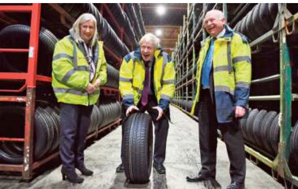
Brexit ahead: Boris Johnson, centre, at Fergusons Transport's warehouse in Washington, England, on Tuesday.

The main Opposition Labour party leader Jeremy Corbyn is trying to upset the