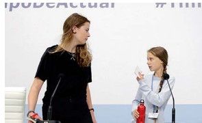
Climate activists Greta Thunberg, and Luisa Neubauer arrive for a news conference at the COP25 Climate summit in Madrid, Spain.