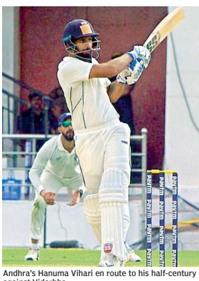
Andhra's Hanuma Vihari en route to his half-century against Vidarbha.