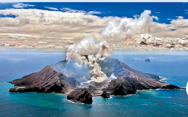
This aerial photo shows White Island after its volcanic eruption in New Zealand on Monday.

This is not the first time that a volcano has erupted on the White Island