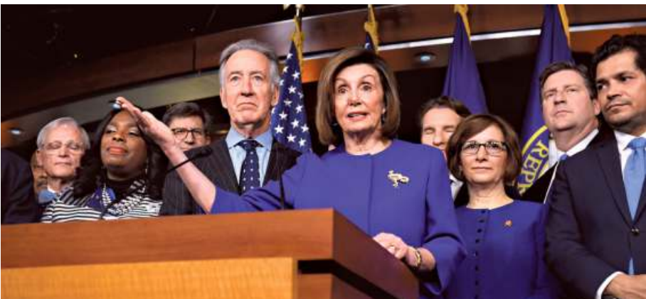
Impeachment roadmap: House Speaker Nancy Pelosi addressing the media in Washington.

Senate trial If the House votes next week, and if they vote to impeach Mr Trump (as a Democrat-controlled House is likely to), he will have to stand trial in the Senate – a process that could commence early next year. Current indications are