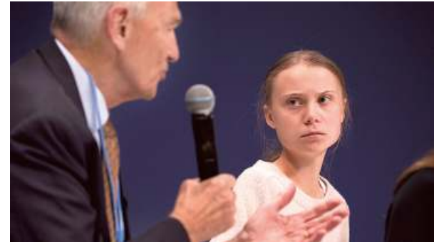
Time to act: Swedish activist Greta Thunberg, right, at the COP25 Climate Conference in Madrid on Tuesday.

It found the U.S. ranks last, followed by Saudi Arabia and Australia, although several countries did report falls in emissions last year, largely due to an industry-