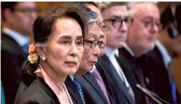
Battle lines drawn: Aung San Suu Kyi at the start of a three-day hearing on a Rohingya genocide case at the ICJ.

“To stop these acts of barbarity and brutality that have shocked and continue to shock our collective conscience. To stop this geno-