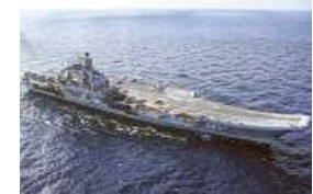
The fire reportedly broke out during welding operations.

The Investigative Committee, the nation's top state investigative agency, has