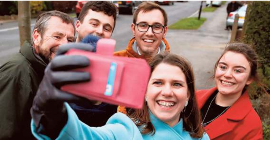
Final countdown: Leader of Liberal Democrats Jo Swinson taking a selfie in Sheffield.

The 'Remainers' Under Jo Swinson, 39, the Liberal Democrats hope to capture the votes of "Remainers" with a clear message to cancel Brexit, pitching themselves as the pro-EU party, as opposed to the pro-Brexit Conservatives and undecided Labour. The Lib Dems, who came second in EU elections in May, have seen their ranks swell after defections by dissident pro-EU Conservative MPs. But polls suggest they could lose some of their 21