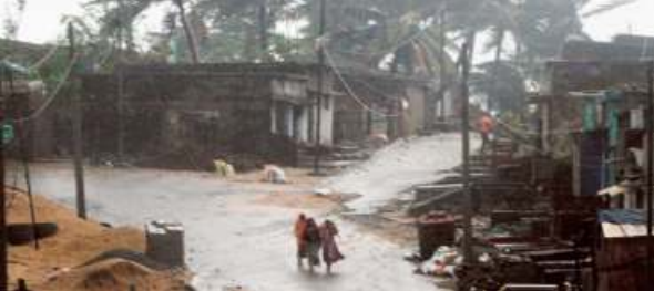
Weathering the storm: People walking towards a shelter during Cyclone Titli in Odisha in 2018.

JACOB KOSHY NEW DELHI International technology company IBM plans to make a high-resolution weather forecast model that will also rely on user-generated data to improve the accuracy of forecasts available in India. IBM GRAF, as the forecast system is called, can generate forecasts at a resolution of 3 kilometres. This is a significantly higher resolution than the 12-kilometre models used by the India Meteorological Department to generate forecasts. These weather forecast techniques rely on dynamic modelling and collect a trove of atmospheric and ocean data, crunch it in supercomputers and generate forecasts over desired timeframes – three days, weekly or fortnightly. "From the