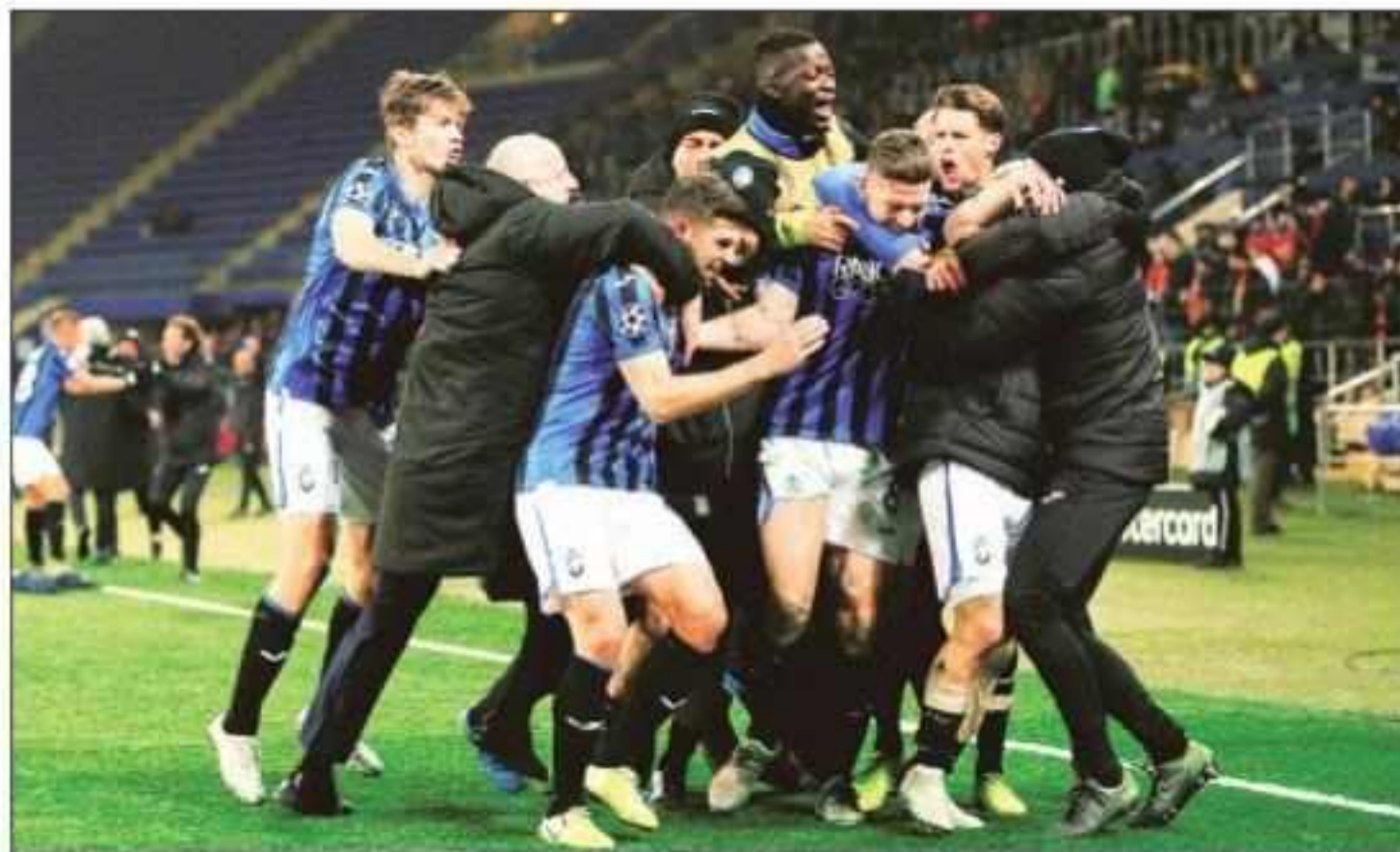
Atalanta celebrate their historic win against Shakhtar Donetsk on Wednesday.

English champions City to progress, but despite taking an early lead through Dani Olmo, were sent packing by a Gabriel Jesus hat-trick before teenage midfielder Phil Foden wrapped a 4-1 win for Pep Guardiola's side.