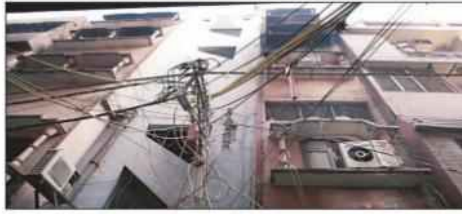
Three minors told police they had been employed on the second and third floors at manufacturing units in the building for the last six-eight months.

"Police recorded the statement of six children; one of them managed to escape from the hospital after treatment. One of the survivors, in his statement, told police he hails from Bihar and came to Delhi with the help of a relative who was already working at another unit in Anaj