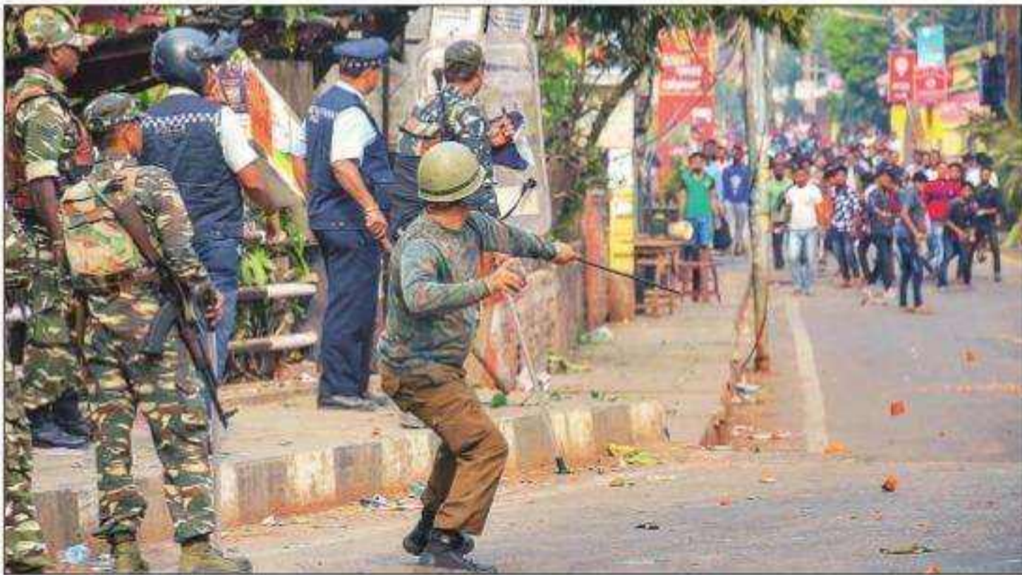
Protesters clash with security personnel in Guwahati on Thursday.