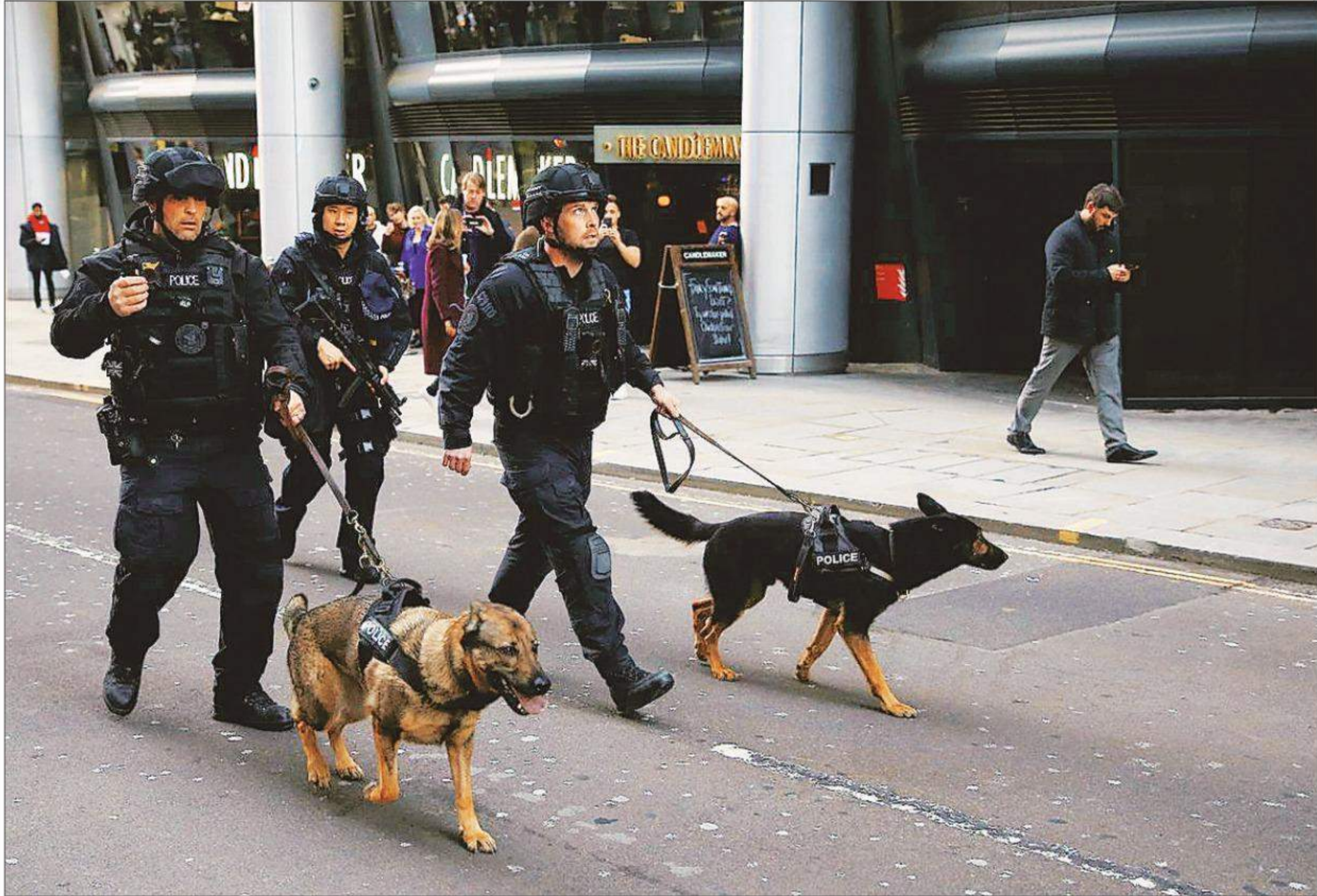
Police officers near the site of the attack at London Bridge on November 29; (below) A video grav of police moving to apprehend the terrorist.

Regardless of sentence length, most criminologists favour investment in de-radicalisation, which aims to strip terrorists of