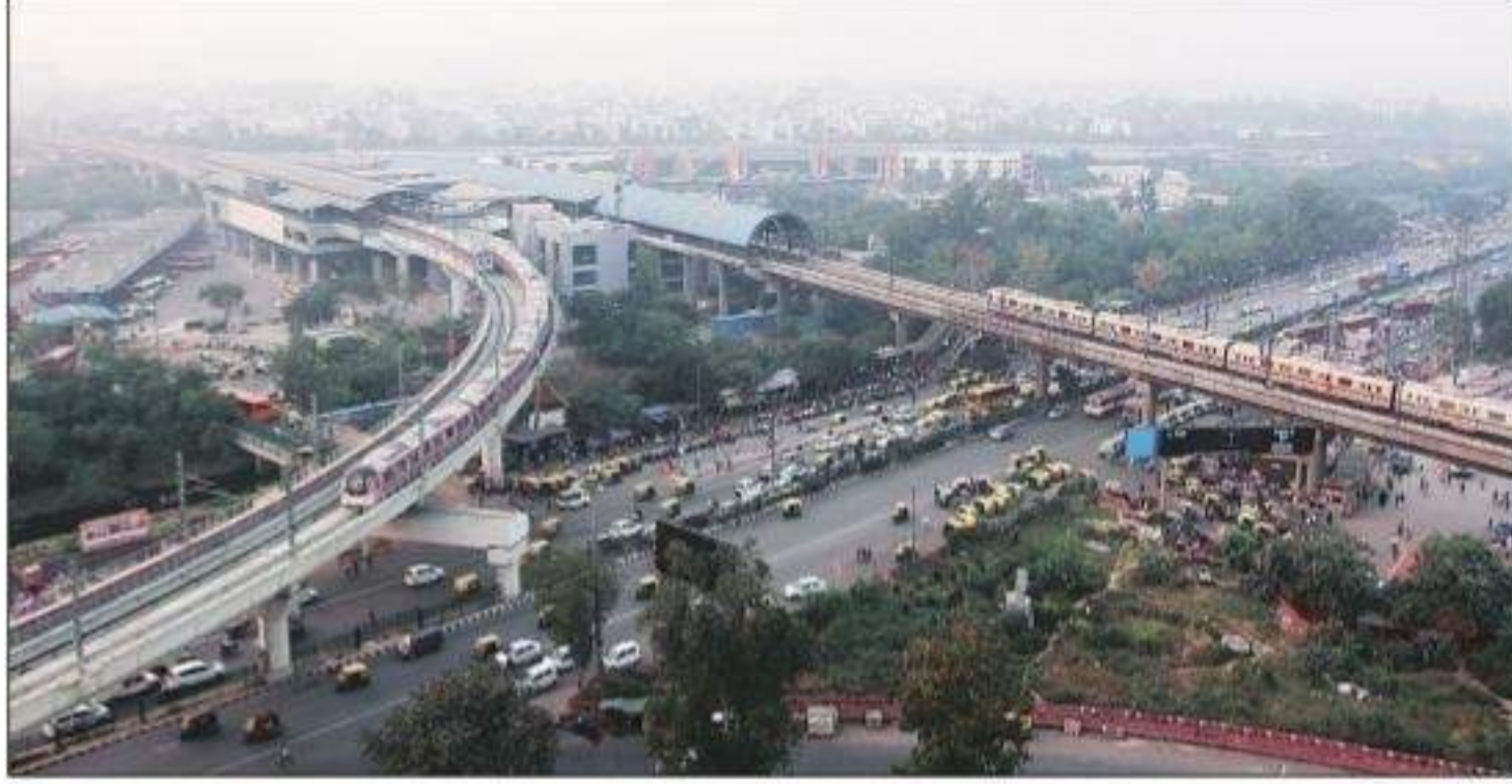
DMRC said Metro, bus routes should not run parallel. Archive

The DIMTS submitted its final draft report in February this