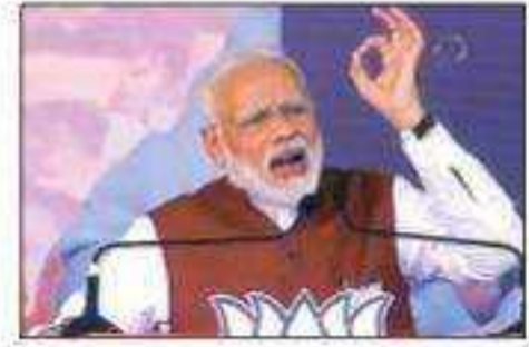
PM Modi at a poll rally in Dhanbad on Thursday.

IN HIS first public comments on the Citizenship (Amendment) Bill after it was passed in Parliament, Prime Minister Narendra Modi reached out to Assam, where violent protests against the Bill entered the second day Thursday, assuring people that their identity and culture would be protected. He also accused the Congress and its allies of spreading confusion over the Bill's provisions and fanning the