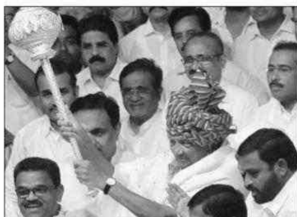
NCP leaders with party chief Sharad Pawar as he celebrated his birthday in Mumbai on Thursday.

NCP's Jayant Patil will handle finance and planning along with housing, public health, cooperation, food and civil supplies, labour and minority affairs. On the other hand, the other NCP minister, Chhagan Bhujbal, will handle portfolios of rural devel-