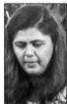
Pankaja Munde says won't quit BJP, plans statewide tour from January 26

At a public rally held at Gopinath Gad in Beed district's Parli in Marathwada, former minister Pankaja Munde raised the banner of revolt against Fadnavis in the presence of state BJP president Chandrakant Patil, who spoke at the event and assured that all voices in the party would be heard. Senior leader and party rebel Eknath Khadse too invoked Munde senior to point out that he had changed the upper caste-Brahmin image