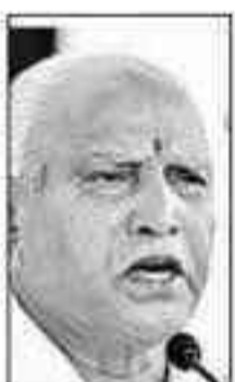
Karnataka CMBS Yediyurappa

KARNATAKA CHIEF Minister B S Yediyurappa, whose government now has a clear majority in the Assembly, is considering induction of two more deputy chief ministers to go with the three existing ones or doing away with the post of deputy CMs, sources in the government indicated.