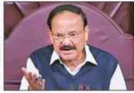
Rajya Sabha chairman M Venkaiah Naidu

Replying to the concerns of members, Law Minister Ravi Shankar Prasad recounted the decades of oppression of SC/STs and said the government would “look into” the concerns about nomination of Anglo-Indians. He said the 10-year renewals give the government an opportunity to assess the condition of SC/STs.