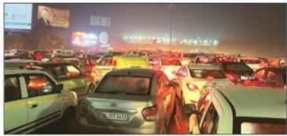
Vehicles stuck on the DND Thursday night. Express