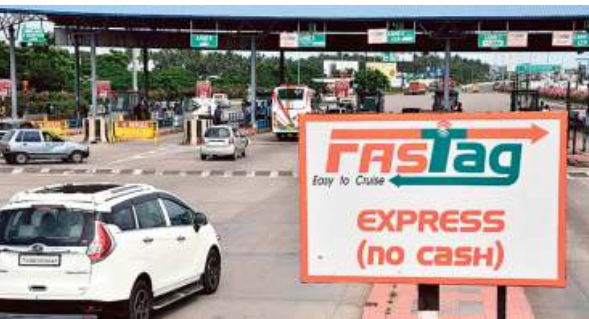
No waiting: The government had earlier extended the date to December 15 for making FASTag mandatory.

This should be considered on a case-to-case ba-