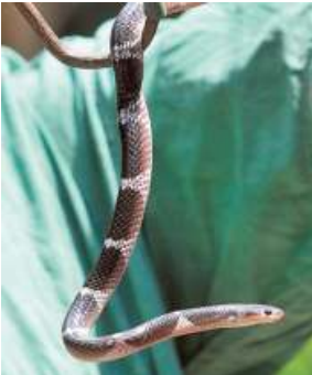
A common krait.

The data, tabled in the Lok Sabha on November 29 in response to a question by P.P. Chaudhary, also points to the high incidence of the cases - 1.78 lakh cases in 2016, 1.58 lakh in 2017 and 1.64 lakh in 2018. The other States with high number of deaths are Odisha with 365 (120, 147 and 98) and Madhya Pradesh 248 (113, 96 and 39). Andhra Pradesh recorded 230 deaths (28, 85 and 117) and Tamil Nadu 132 (44, 38 and 50).