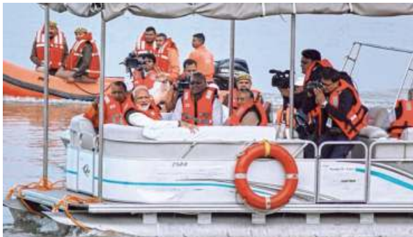
Thorough appraisal: Prime Minister Narendra Modi reviews the Namami Gange project in Kanpur on Saturday.

Chief Ministers of Uttar Pradesh and Uttarakhand and several Union Ministers attend