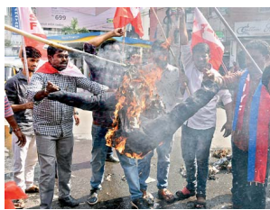
Students burn the effigy of the central government in Himayatnagar on Saturday.

Law enforcement agencies did not restrict such messages on social media, but when the Supreme Court delivered its judgment on the Ayodhya dispute, police advisories asked the public to refrain from raising dissent. The government succeeded in its mission. He urged that a team of legal experts be constituted to provide legal aid to those prosecuted for expressing dissent. The government will first implement the National Register of Citizens and later the CAA. "We have to give a clear message that we are ready for detention centres, but will not submit documents to prove our inability to live with the CAA," he said. Former chairman of the Minorities Commission, Abid Rasool Khan said that other communities will suffer more than Muslims but the Narendra