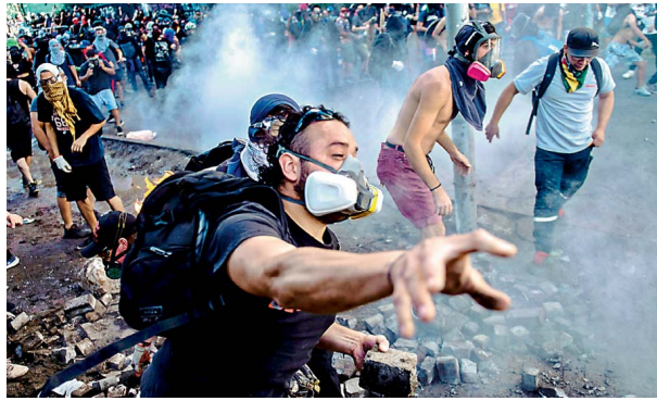
Protesters clash with riot police during a protest against President Sebastian Pinera's government, in Santiago, Chile on Saturday.