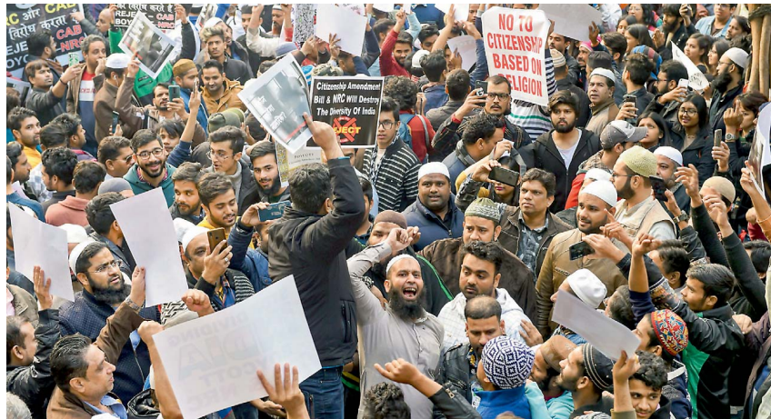
Protestors during a demonstration, #NOTINMYNAME, demanding withdrawal of the Citizenship Amendment Act, at Jantar Mantar in New Delhi, on Saturday.

New Delhi, Dec. 14: Senior Congress leader P Chidambaram on Saturday alleged India was suspect in the eyes of the world as its economy and polity had broken and led to the rise of the BJP of pushing the agenda of Golwalkar and Savarkar and not that of Nehru, Nehru and Ambedkar. The former finance minister said with the economy and polity broken, the government will raise taxes in the coming times that will further sink the economy. "Today, India is suspect in the eyes of the world. India's economy is broken.