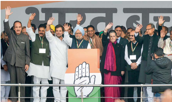
Former PM Manmohan Singh, along with Congress president Sonia Gandhi and former president Rahul Gandhi, at the Bharat Bachao rally at Ramliya Maidan, in New Delhi, on Saturday.