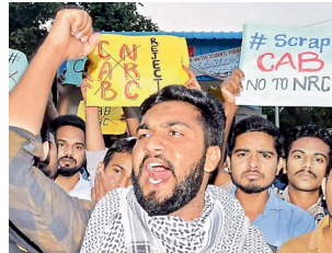
Maulana Azad National Urdu University students protest against the CAA in Hyderabad on Saturday.