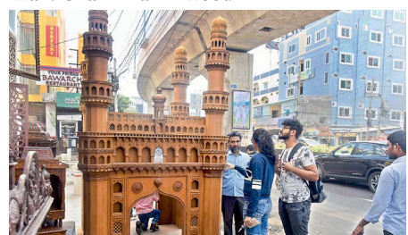
Onlookers admire a 10-foot replica of the Charminar made of wood that is being built at a shop in Madhapur on Saturday.