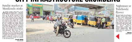
The Speak Out page published in Deccan Chronicle on December 2.

The Speak Out page of Deccan Chronicle has moved the Telangana High Court to take up a suo motu public interest litigation regarding the condition of the city's infrastructure. Chief Justice Ravindra Singh Chauhan directed the High Court Registrar to treat the Speak Out page as a take-up PIL and asked the relevant departments and officials responsible to the PIL. The High Court took cognizance of the December 2 edition of Speak Out, which carries readers' letters regarding poor civic facilities with the headline 'City Infrastructure Crumbling'. The Court also took cognizance of two letters written by a Sunday market at Manikonda stinks and 'Nightmare at Tolichowki'.