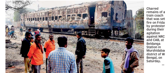
Charred remains of a train coach that was set on fire on Friday by protesters during their agitation against NRC and CAB at Belganga Station in Murshidabad district of West Bengal, on Saturday.

"All exams postponed. New dates to be announced in due course of time. Vacation declared from December 16 to January 5. University will reopen on January 6, 2020," an official said. The university turned into a virtual battlefield on Friday when students and policemen clashed with each other as the students tried to march to Parliament in protest against the Act. The students had called for a university lockdown on Saturday and had planned to boycott the exams.