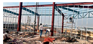
Works for a new office of the Chief Minister on the ninth floor of BRKR Bhavan underway.

Chief Minister K. Chandrababu Naidu, who had refrained from running administrative affairs from the Secretariat, may visit the temporary Secretariat at Burgula Ramakrishna Rao (BRKR) Bhavan occasionally in the New Year.