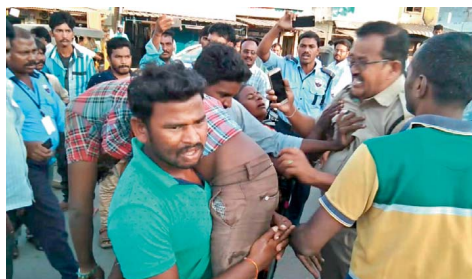
A man carries away the body of his relative at the Nandyal Government Hospital while another man appears to stop the police, in Nandyal on Saturday.