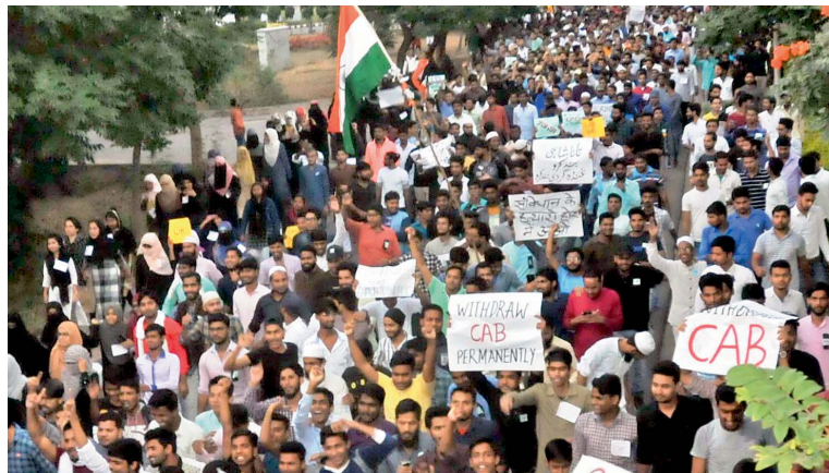
Students of Maulana Azad National Urdu University hold a protest rally against the Citizenship Amendment Act and the National Register of Citizens of India on the varsity campus on Saturday.