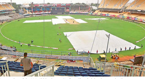
An overview of the M.A. Chidambaram Stadium. The pitch has been under the covers since Friday morning and India had to cancel their training session on Saturday due to heavy showers.

Sachin Tendulkar has sought the help of netizens in tracking down a Chennai hotel waiter who once helped him redesign his arm-guard. Tendulkar on Saturday recalled an incident at one of Chennai's hotel where a waiter, who had come to his room to serve coffee, and asked whether he could discuss cricket. When Tendulkar asked him to go ahead, the waiter told him about a particular change in his bat swing while he had his elbow guard on. "He said 'Sir, I have noticed whenever you wear an arm guard your bat swing changes.' I don't think I had spoken about this to anyone in the world. He said I was a huge fan and rewind 5-7 times and watch every ball. I said, 'yes! You are the only person in the world who figured that out. So you figured