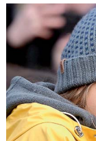
Greta Thunberg looks on as she takes part in the Friday for Future strike on climate emergency, in Turin.

Turin, Dec. 14: Tireless teenage activist Greta Thunberg has been crisscrossing the globe by cat train and boat — but not plane — to demand action on climate change. But now even she needs a rest. Fresh from being named Time magazine's Person of the Year, the 16-year-old Swede joined thousands of students in the north Italian city of Turin on Friday for a protest to pressure the government to take more action to curb carbon emissions. Thunberg, who refuses to fly, travelled to Turin by train and car from Madrid after attending a UN climate summit in the Spanish capital. She arrived in Europe only a few days earlier aboard a catamaran after spending months campaigning in the United States. Now she needs a little downtime. "I will be home for Christmas and then I will take a holiday break because you need to take rest," she told reporters in Turin. "Otherwise you cannot do this all the time." — Reuters