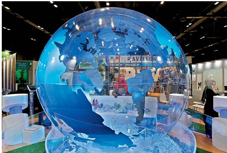
A woman looks at a globe at the COP25 climate talks congress in Madrid, Spain.

Whakatane, Dec. 14: Police divers working in near zero visibility in contaminated waters around New Zealand's volcanic White Island tried to find the remaining two victims of an eruption that left at least 16 dead and dozens severely burned. Ash and other fallout from Monday's eruption has made the sea near the island toxic and divers have to be washed clean after every completed dive. Police deputy commissioner John Teneale said the search conditions "unique and challenging". "Divers have reported seeing a number of dead fish and eels washed ashore and floating in the water. Conditions in the water are not uniform with between zero and 2 meters visibility depending on location," he said. Navy divers are expected to join the police search effort later. Military specialists on Friday recovered six bodies from the island in a carefully planned but risky operation.