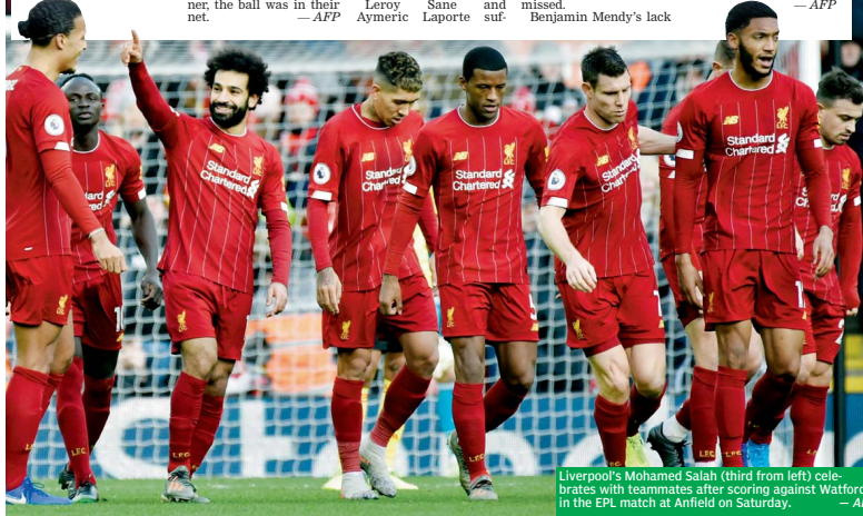
Liverpool's Mohamed Salah (third from left) celebrates with teammates after scoring against Watford in the EPL match at Anfield on Saturday.

Even before Laporte's injury, City appeared short at centre-back following the loss of captain Vincent Kompany, who left at the end of last season to take charge of Anderlecht. Kompany's final years at the club were ravaged by injury, but he played a vital role late last season as City won their final 14 league games to pip Liverpool to the title by one point. The Belgian was an inspirational leader and his departure left City without a figurehead when things get tough.