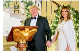
US President Donald Trump and the US First Lady Melania Trump at the Congressional Ball.

Earlier, Brazil President Jair Bolsonaro too had called Greta a "brat in Portuguese."