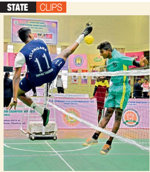
Action from the quarterfinal match between Telangana State (left) and Andhra Pradesh at the 23rd Junior National Sepaktakraw Championship at the Victory Play Ground Indoor Stadium in Hyderabad on Saturday. Andhra Pradesh won 21-17, 21-17.