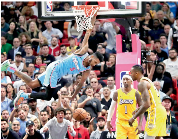
Miami Heat forward Derrick Jones Jr. (from left) dunks over Kentavious Caldwell-Pope and Dwight Howard of the Los Angeles Lakers during their NBA basketball game in Miami on Friday. Lakers won 113-110.

● Anthony Davis scored a game-high 33 points and 10 rebounds while LeBron James delivered 28 points, 12 assists and nine rebounds as the Los Angeles Lakers handed the Miami Heat their first loss at home with a 113-110 victory.