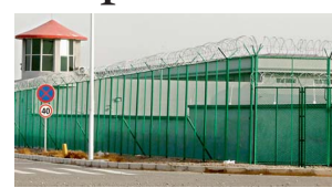
The Chinese government has long struggled with its 11-million-strong Uighur population, an ethnic Turkic minority native to Xinjiang, and in recent years has detained 1 million or more Uighurs and other minorities in the camps.

Xinjiang, Dec. 14: The Xinjiang regional government in China's far west is deleting data, destroying documents, tightening controls on information and has held high-level meetings in response to leaks of classified papers on its mass detention camps for Uighurs and other minorities, according to four people in contact with government employees. Top officials deliberated how to respond to the leaks in meetings at the Chinese Communist Party's regional headquarters in Urumqi, Xinjiang's capital, some of the people said. The meetings began days after The New York Times published last month a cache of internal speeches on Xinjiang by top leaders including Chinese President Xi Jinping. They continued after the International Consortium of Investigative Journalists worked with news organisations around the world to publish secret guidelines for operating detention centers and instructions on how to use technology to target people.