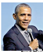
Barack Obama, former US president

Kuala Lumpur, Dec. 14: Former US President Barack Obama said the Paris Agreement on climate change may fall short of expectations but is still the way forward to achieve progress and encourage businesses to invest in clean energy. Nearly 200 nations pledged to cut greenhouse emissions and help poor countries cope with the worst effects of an already warming planet under the accord signed in 2016 that was a cornerstone of Obama's environmental legacy. But his successor abandoned that legacy when his administration notified the UN last month that the US would pull out of the accord. Trump has said the agreement could impede growth and impinge on US sovereignty. Obama said he knew the standards set by that country were insufficient but that the accord was practical and meant for the long haul. Obama didn't mention US withdrawal from the accord. He said there is no "silver bullet" to solve climate change but he remains optimistic that global warming can be slowed down. "It's too late for us not to have some impacts. And so there's gonna have to be some adaptation that's going to take place. The oceans will be rising and that is going to displace people. And so we're going to anticipate and care for some of the consequences of that, including large-scale migration and disruptions that are going to be very costly. But there is a big difference between the ocean rising three feet and rising six feet," he said. — AP