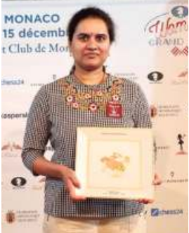
Koneru Humpy.

She would next play the women's World rapid and blitz championship from December 25 though it “is not my cup of tea being a classical player”.