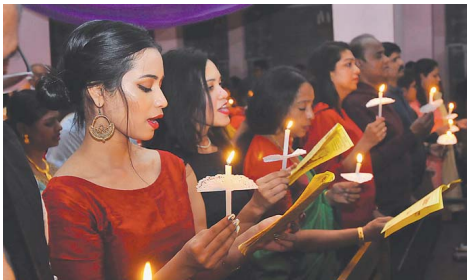
Carol singers perform at the Centenary Methodist Church in Chapel Road at Abids on Sunday.