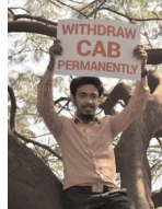
A protester sitting on a tree holds a poster.

Many trains going to or through West Bengal, such as Hyderabad to Howrah and Secunderabad to Guwahati, were terminated at Uluberia, where passengers complained on social media about this. "To help them, the East Coast Railway (ECR) announced later in the day that it would run special trains between Puri and Chennai."