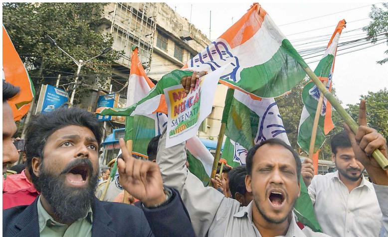
Members of West Bengal Human Rights Cell stage a protest rally against CAA and NRC in Kolkata on Sunday.

A protest march against the recently-passed Citizenship (Amendment) Act, held by students of Jamia Millia Islamia in South Delhi, became violent Sunday evening and eventually turned the upmarket New Friends Colony into a battleground. At least four DTC buses, a fire tender and several other vehicles were set ablaze and damaged by the miscreants, who even threw stones at the police personnel, who in return resorted to a lathi-charge and fired teargas shells. Jamia's chief proctor claimed that the police forcibly entered the campus as no permission had been taken and both staff and students were beaten up. At Jantar Mantar, students from the Northeast states protested against the CAA, and termed it as "anti-constitution" and a threat to the identities of indigenous people in the region.