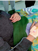
Delhi Commission for Women chief Swati Maliwal hospitalised after she fell unconscious at Lok Nayak Hospital in New Delhi on Saturday.