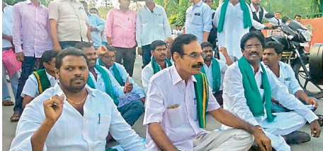
Nizamabad turmeric farmers protest in this file picture

The farmers want a turmeric board and a minimum support price (MSP) for red jowar and turmeric.