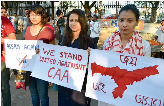
Members of the Assamese community (top) protest at Dharna Chowk near Indira Park in Hyderabad against the Citizenship Amendment Act. Earlier on Sunday, a large number of people turned up to protest the legislation as well as the proposal to implement the National Register of Citizens nationwide.

An hour into the protest, the road on which Dharna Chowk is located got open to traffic. But as the crowd swelled, police had to barricade the road. Some protesters took to open marches in the neighbourhood while many sat at the Chowk to listen to the speakers.