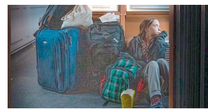
Climate activist Greta Thunberg tweeted a picture of her being stuck on floor of crowded German train on her way back home after climate talks.

DB responded testily, pointing out that Thunberg had travelled in first class during her journey through Germany.