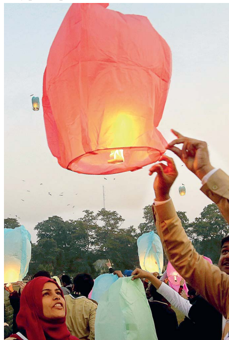
Members of a civil society group release lanterns into the sky to pay tribute to the victims of an attack on a Peshawar school in 2014, during a ceremony marking the fifth anniversary of the attack in Lahore, Pakistan on Sunday. Pakistani Taliban militants attacked an army-run school in Peshawar, killing 150, mostly kids in 2014.