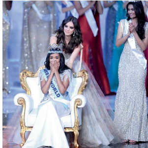
(From L to R), Newly crowned Miss World 2019 Miss Jamaica Toni-Ann Singh reacts at the Excel arena in east London. Jamaican beauty celebrates her winning moment with family. (Below), Miss India Suman Rao, performs at the event.

Sanandita, Dec. 15: Bolivia will issue an arrest warrant in the coming days against former leftist president Evo Morales, accusing him of sedition, interim Bolivian President Jeanine Anez said. Morales is in Argentina, granted refugee status this week just days after the inauguration of new President Alberto Fernandez. Fernandez succeeded outgoing conservative Argentine leader Mauricio Macri, who lost his bid for re-election in October. Morales had spent the previous month in Mexico in the wake of a highly-contested October election in Bolivia. He had proclaimed victory after his government was accused of manipulating the vote results. Morales, who had been in power nearly 14 years, left Bolivia as the controversy grew. Anez said, "The arrest warrant will be issued in the next few days, because we have already brought the charges."