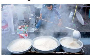
A volunteer chef prepares rice to be served to Iraqi protesters as part of a free meal, at the center of Baghdad, Iraq.

Baghdad, Dec. 15: In Baghdad's Tahrir Square, there are the anti-government protesters demonstrating for a better future for Iraq, and there are the volunteers who feed them. From stuffed lamb and fish, to the giant pots of soups and rice, to the plates of lentils and other beans, there is no shortage of food to go around. Volunteers from the capital and southern provinces cook traditional dishes that reflect the country's rich cuisine and bring their riches together.