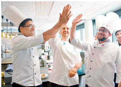
Viswanathan Anand (left) celebrates with Maxime Vachier-Lagrave (right) after winning the Master Chef challenge held on the sidelines of the Norway chess tournament in Stavanger.