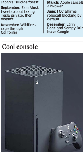
Xbox boss Phil Spencer revealed the next Xbox, previously known as Project Scarlett. It is called Xbox Series X, and it is launching next holiday season. It has a brand-new controller, and yes, you can use it horizontally.