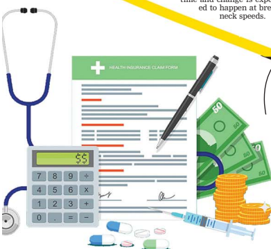
The writer is CEO, BankBazaar.com

health risks exacerbate, you must have coverage for all members of your family. This should ideally be over and above employer-sponsored insurance. You could buy an individual cover or a family floater for your family and another for your parents. You will be well-advised to have comprehensive coverage with exclusions such as coverage of pre-and post-hospitalisation, even if it means paying more.