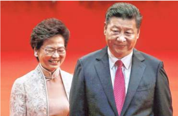
Full support: Carrie Lam says she feels encouraged by Xi Jinping’s recognition of her efforts.

REUTERS HONG KONG Chinese President Xi Jinping offered his support for Hong Kong leader Carrie Lam on Monday, praising her courage in governing the Chinese-ruled hub in these “most difficult times” after months of often violent anti-government protests. His comments came after Hong Kong police fired tear gas in late night street clashes with anti-government protesters as the former British colony’s worst political crisis in decades shows no sign of resolution. “The situation in Hong Kong in 2019 was the most complex and difficult since its return to the motherland,” Mr. Xi told local media in brief comments before a closed-door meeting with Ms. Lam in Beijing. “The central government fully recognises the courage and assumption of responsi-