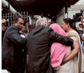
Swiss embassy staffer, in pink shawl, being escorted to a court in Colombo.

Sri Lanka’s reputation as a constitutional state at stake: Bern