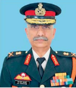
Lieutenant General Manoj Mukund Naravane