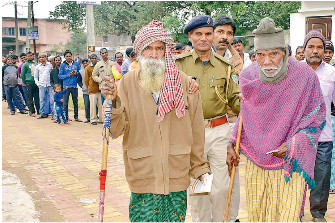
Elderly voters being assisted after casting their votes during the fourth phase of Jharkhand Assembly polls in Dhanbad on Monday.