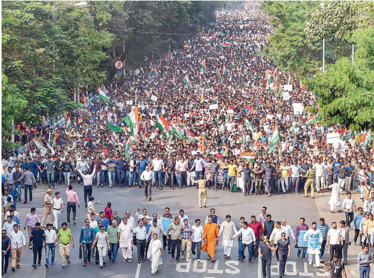
West Bengal Chief Minister Mamata Banerjee leads a rally of thousands of partymen, vowing not to allow the proposed country-wide National Register of Citizens and the Citizenship Amendment Act in the state, in Kolkata on Monday. — PTI

■ Page 8: Jamia V-C seeks probe into police action