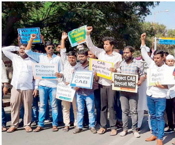
Students of University of Hyderabad and Osmania University protest against the Citizenship Amendment Act on Monday.

There are similar reactions to the protests against the citizenship bills passed in Parliament last week. 'Why protest' and 'what is the problem if there are valid papers' and other such questions are being asked on the one