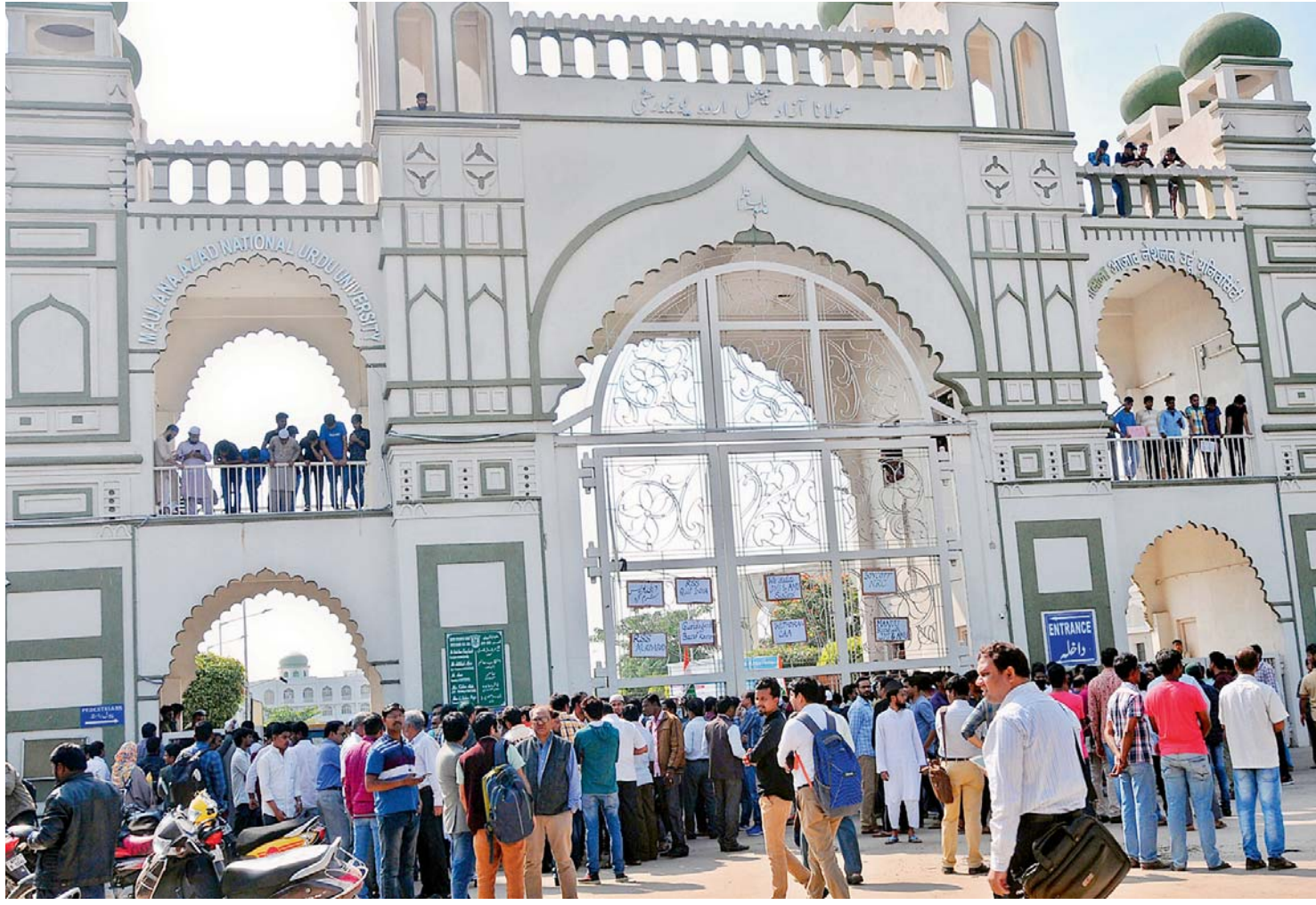
Students of Maulana Azad National Urdu University closed the varsity gates and did not allow teachers to enter the campus in protest against the Citizenship Amendment Act and the national Register of Citizens in Hyderabad on Monday.

STUDENTS MARCHED AT 5 pm on Monday from Hyderabad Central University to the Gachibowli stadium, demanding 'Roll back CAA, Reject all India NRC'. They also raised slogans against the Centre.