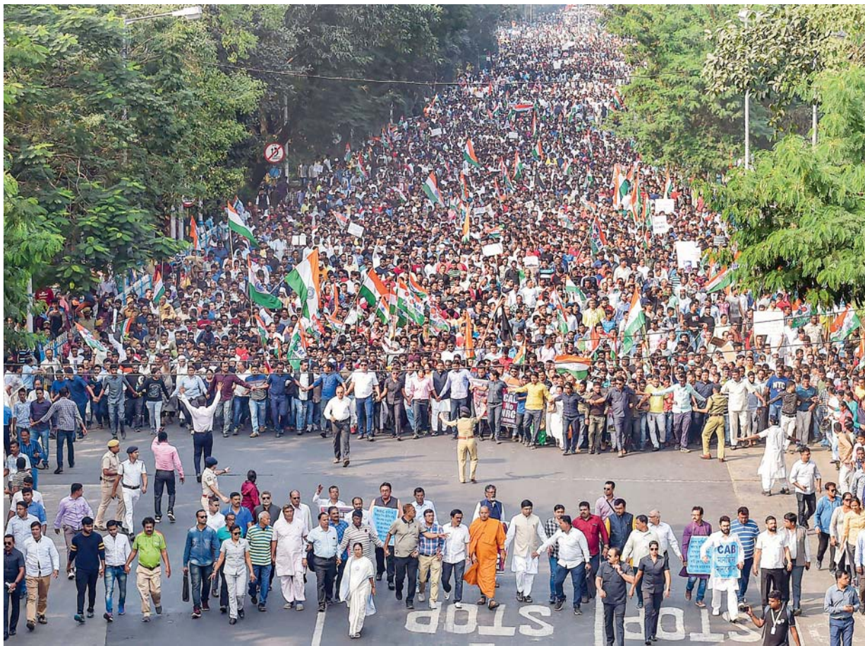
West Bengal Chief Minister Mamata Banerjee leads a rally of thousands of partymen, vowing not to allow the proposed country-wide National Register of Citizens and the Citizenship Amendment Act in the state, in Kolkata on Monday.

■ Page 8: Jamia V-C seeks probe into police action