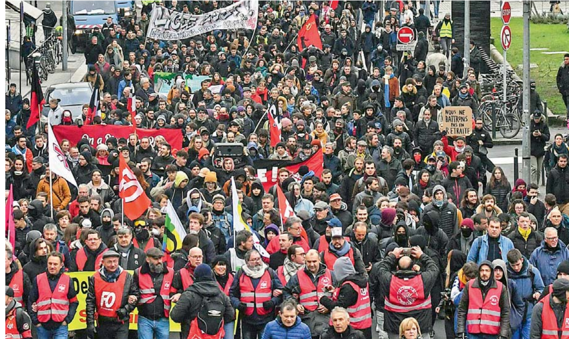
People march in Nantes on Tuesday during a rally as part of a third countrywide day of multi-sector protests over a government pensions overhaul, with the government showing no signs it will give in to union demands to drop the plan. Unions have been striking since Dec 5 in their biggest show of strength in years.