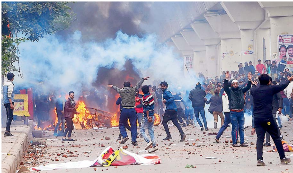
Brick-bats lie on the road as protesters clash with the police against the Citizenship Amendment Act at Seelampur in New Delhi on Tuesday.

Though local residents were seen holding discussions with senior police officers, and mosques were heard making appeals via loudspeaker, asking people to maintain peace and remain calm, two bikes of traffic cops