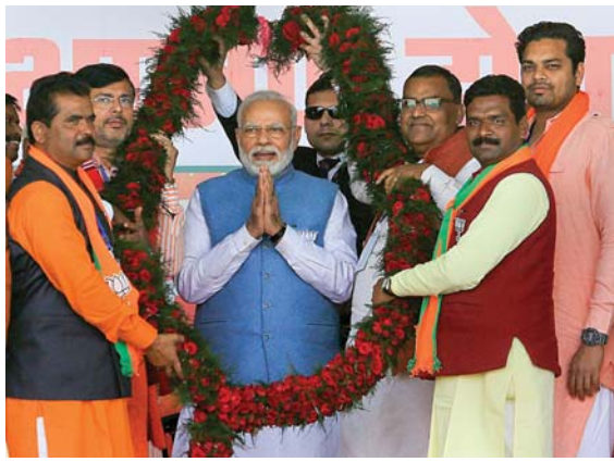
Prime Minister Narendra Modi during a campaign rally BJP candidates ahead of fifth phase of Assembly election, in Sahibganj, Jharkhand on Tuesday. — PTI

He also challenged them to re-introduce Article 370 in the erstwhile state of Jammu & Kashmir and scrap the law against instant Triple Talaq. As campuses across the country erupted in protests over police action at Jamia Millia Islamia, the prime minister asked students to try and see whether they were not being made accomplices in a "conspiracy" where "urban naxals" and others were using their "shoulders to fire" to