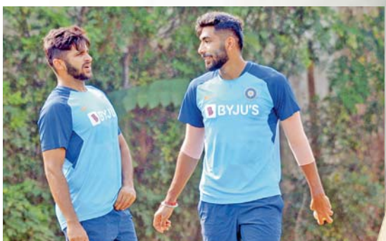
Shardul Thakur and Jasprit Bumrah during a training session at Visakhapatnam on Tuesday.