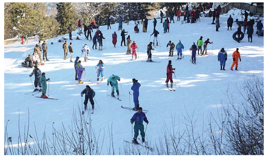
Tourists ski at Kufri near Shimla on Tuesday. Most parts of north India got no respite from the icy winds and biting cold on Tuesday as the mercury continued its downward spiral and the maximum temperature in Delhi was recorded at its second lowest in 22 years.