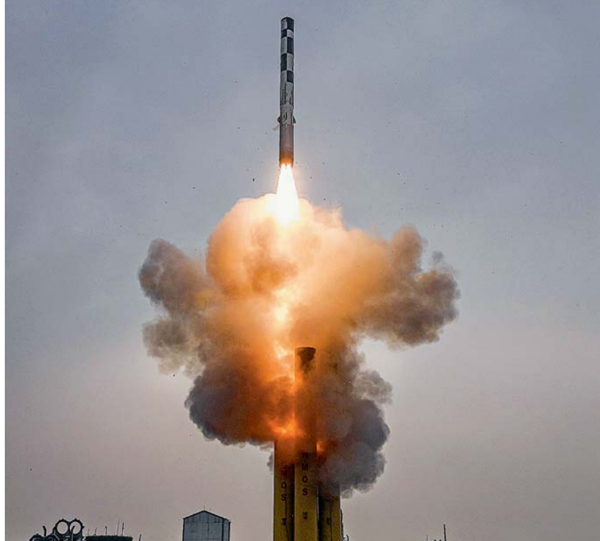
India successfully conducted two separate trials of the supersonic cruise missile BrahMos on Tuesday, one each from the land and air platforms to check its capacity to hit targets with precision. The tests were deemed a success.