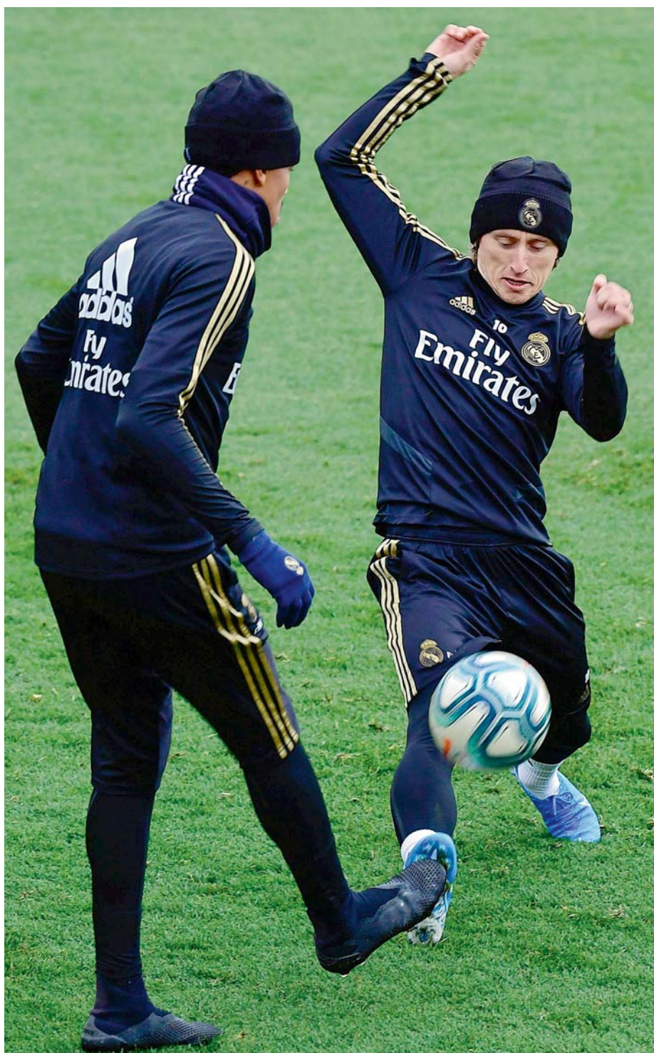
Real Madrid's Luka Modric (right) and teammate Eder Militao during a training session at the Real Madrid City sports facilities in Madrid on Tuesday, eve of their Spanish League match against Barcelona at Camp Nou.

remains a doubt whether it will be a fair decision. Being a boxer and after going through such troubles you can't easily trust anyone. Nikhat claimed that she couldn't participate in the nationals as the BFI wanted her to play the IBL. "BFI wanted me to play the league so I didn't play the nationals and that's why I am right now the fourth choice boxer for the trails in 51kg. I was told by the BFI to play the league," Nikhat said.