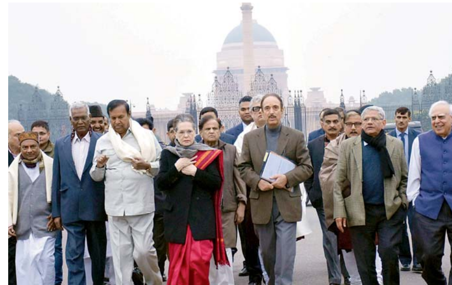
Opposition leaders at Rashtrapati Bhavan after meeting President Ram Nath Kovind on the Citizenship Amendment Act, in New Delhi on Tuesday.

Asserting that India and Bangladesh have been able to resolve some outstanding issues including the land boundary and maritime boundary issue, Naidu said, "India-Bangladesh bilateral relations are considered as a role model of good neighbourly relations." He added that India always believed that a strong, stable and prosperous Bangladesh was in India's interest and "we would like to partner in your journey of progress to become a developed country by 2041."