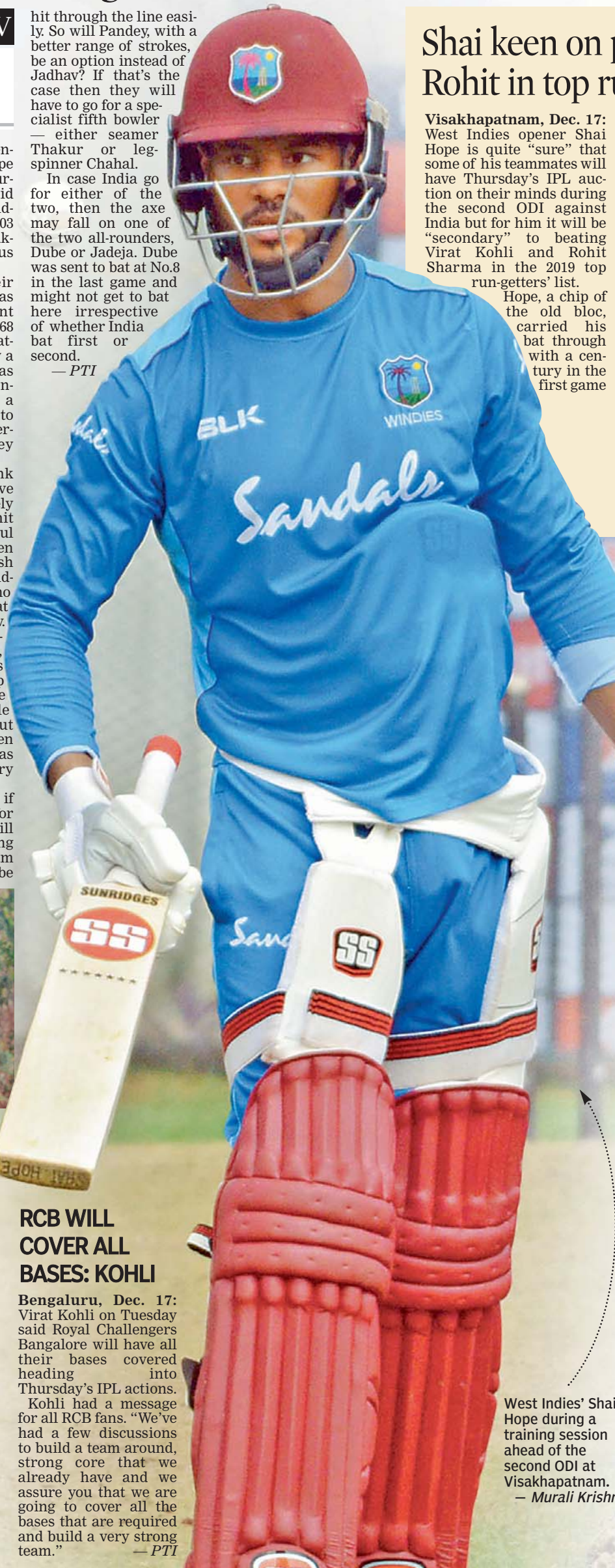
West Indies' Shai Hope during a training session ahead of the second ODI at Visakhapatnam.

Hope is currently third in the ODI run-getters' list this year with 1225 runs behind Virat Kohli (1292 runs) and Rohit Sharma (1268 runs).